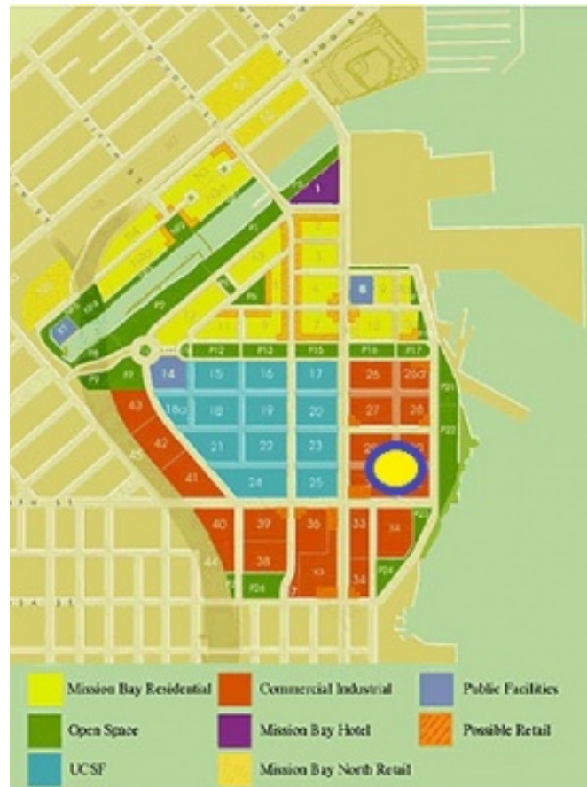
Figure 1: Location of Warrior's Project In Mission Bay South