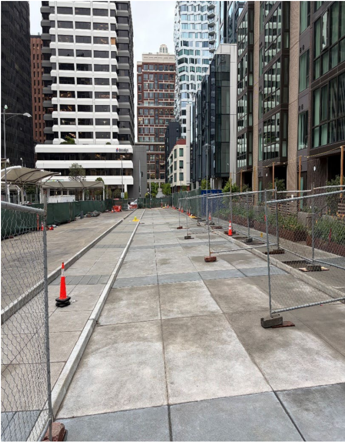
East Clementina – April 2026 Looking northeast from Beale Street