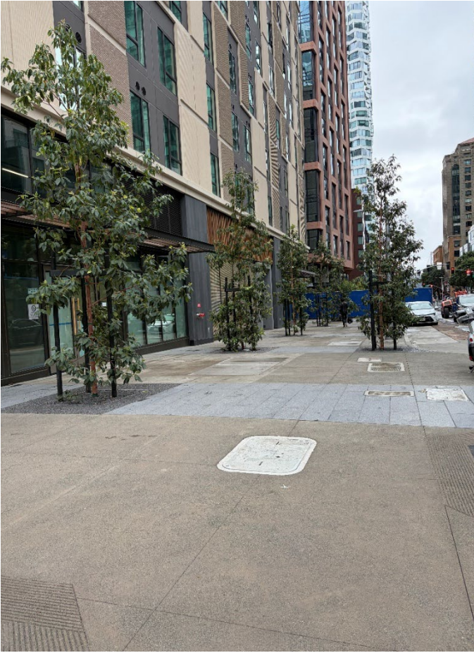
Folsom Street – April 2026 Looking northeast from Beale Street