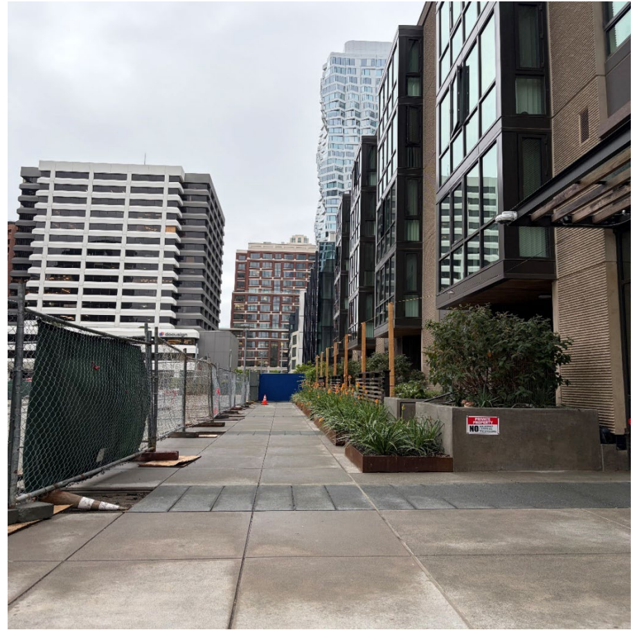
East Clementina – April 2026 Looking northeast from Beale Street