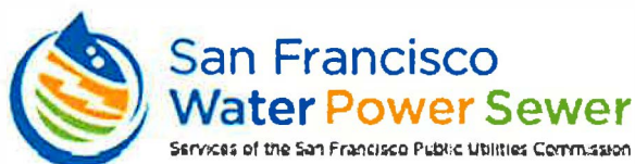
EXHIBIT A-5S SERVICE CONNECTION CHECKLIST