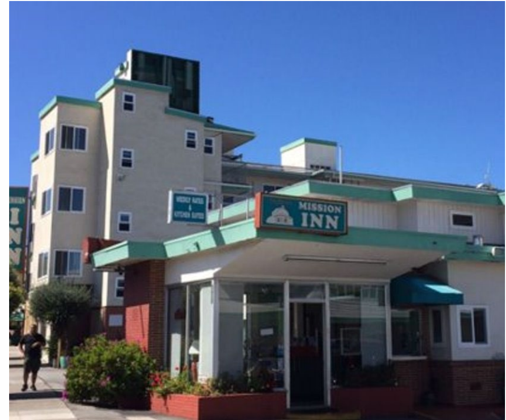
Property at 5630 Mission Street