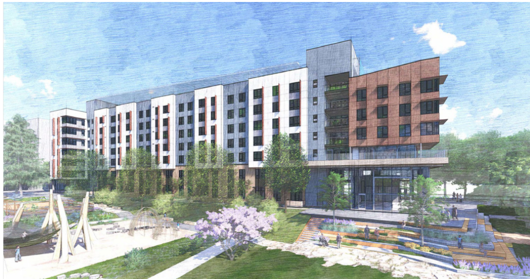
Block E - Affordable Housing