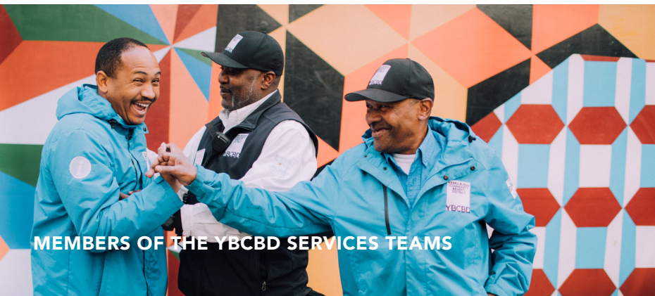
MEMBERS OF THE YBCBD SERVICES TEAMS