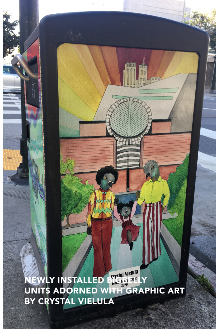
NEWLY INSTALLED BIGBELLY UNITS ADORNED WITH GRAPHIC ART BY CRYSTAL VIELULA