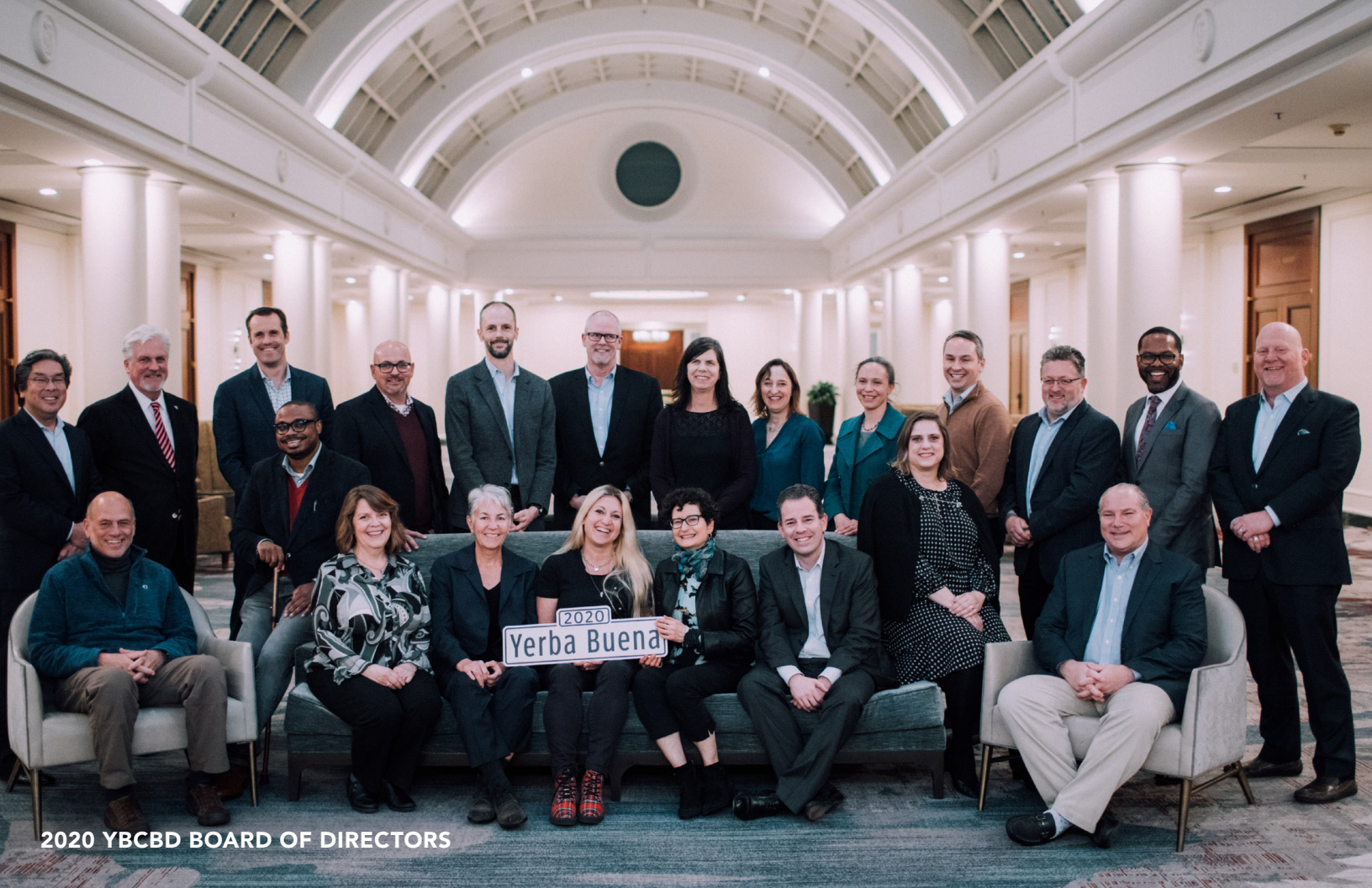
2020 YBCB BOARD OF DIRECTORS