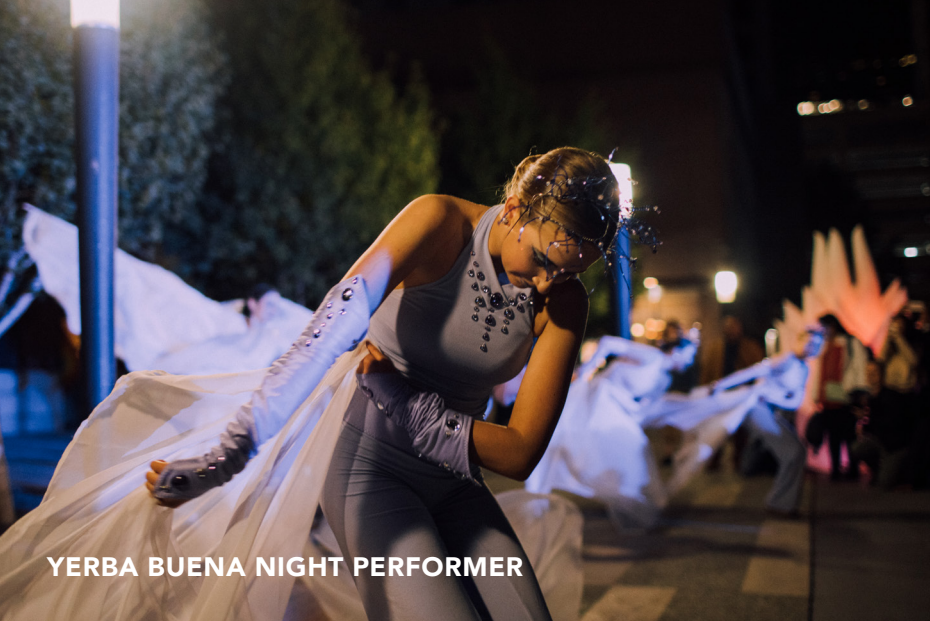
YERBA BUENA NIGHT PERFORMER