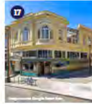
17 A. Cavalli Bookstore / Vesuvio Cafe 203 Columbus Avenue Year Built: 1913 Significant for its association with the Counterculture movement in San Francisco