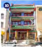
10 Chinese Consolidated Benevolent Association 848 Stockton Street Year Built: 1908 Significant for its association with Chinese cultural heritage as the former HQ of the six hui-tuan, an alliance of rival Chinese factions, which represented the interests of all Chinese in O.F. and the West