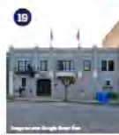
19 Italian Athletic Club 1690 Stockton Street Year Built: 1936 Significant for its association with Italian American cultural heritage and for its Art Deco style architecture