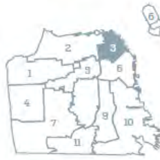
San Francisco Supervisoral Districts