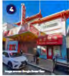
4 Great China Theater 626 Jackson Street Year Built: 1924 Significant for its association with Chinese cultural heritage originally occupied by the Ying Wei Lun Hoop Theatrical Co., a Chinese Opera company, and later as The Great Star Theater showing Chinese-language movies