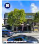
16 Finocchio's 500-508 Broadway Year Built: 1916 Significant for its association with LGBTQ history in San Francisco as a nightclub featuring cross-gender entertainment popular with both the queer community and tourists