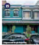
15 Mone's Candlelight Lounge 468-478 Broadway Year Built: 1907 Significant for its association with LGBTQ history in San Francisco as a queer nightclub