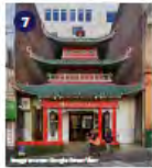
7 Chinese Telephone Exchange 748 Washington Street Year Built: 1909 Significant for its association with Chinese cultural heritage as the only Chinese telephone exchange in the United States