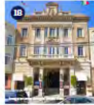
18 Fugazi Building 678 Green Street Year Built: 1912 Significant for its association with the Italian American cultural heritage, LGBTQ history in San Francisco, and architect of merit Italo Zanolini