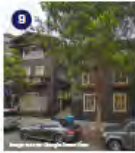
9 Telegraph Hill Neighborhood Association 1786 Stockton Street Year Built: 1907 Significant for its First Bay Tradition architecture designed by architect of merit Bernard Mayboeck