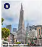
6 Transamerica Pyramid 600 Montgomery Street Year Built: 1976 Significant for its Brutalist architecture designed by architect of merit William Pereira & Associates