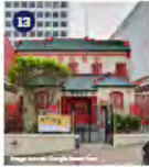
13 Nam Kue School 755 Sacramento Street Year Built: 1925 Significant for its association with Chinese cultural heritage as the original headquarters of the Rock Yam Benevolent Society and later as the earliest and longest surviving school preserving Chinese culture and language in America