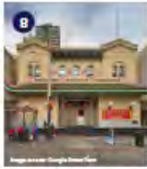
8 Central Chinese High School 827-829 Stockton Street Year Built: 1914 Significant for its association with Chinese cultural heritage as a school that promoted Chinese culture and study