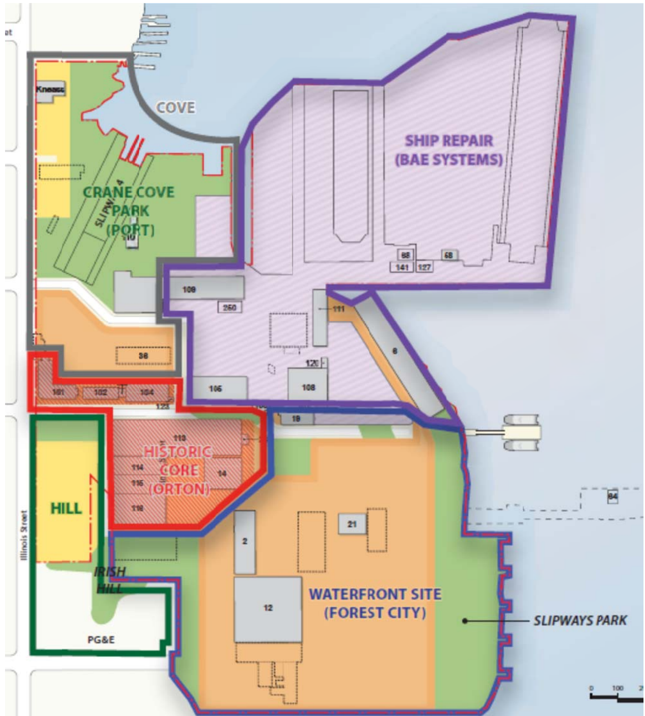
Figure 1: Existing and Proposed Pier 70 Projects