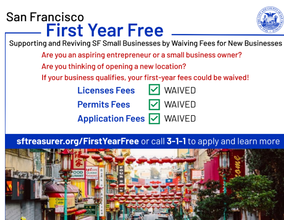
Figure 3: First Year Free Outreach Materials 40