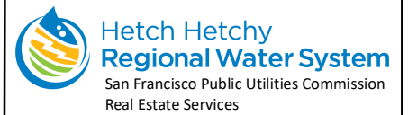
Exhibit B City's Real Property Sunol, CA

The City does not guarantee that the information is accurate or complete. The City is not responsible for any damages arising from the use of data. Users should verify the information before making project commitments.