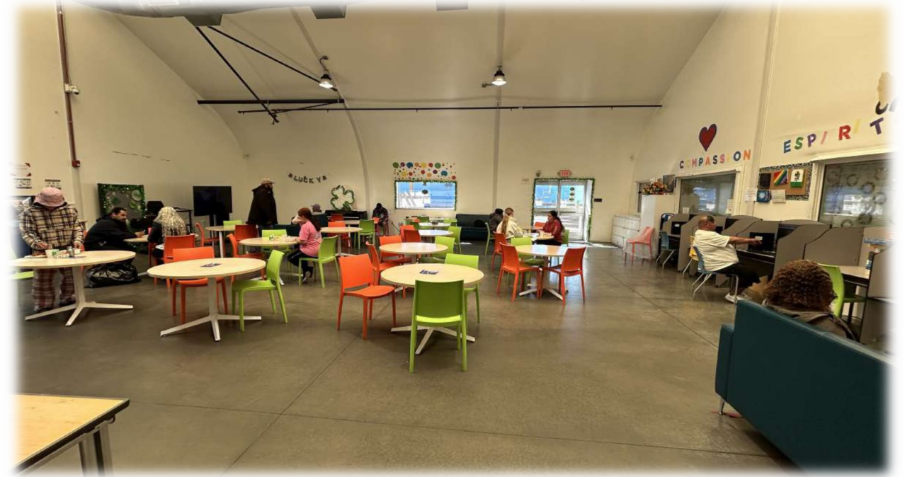
Photo: Common area at Division Circle Navigation Center