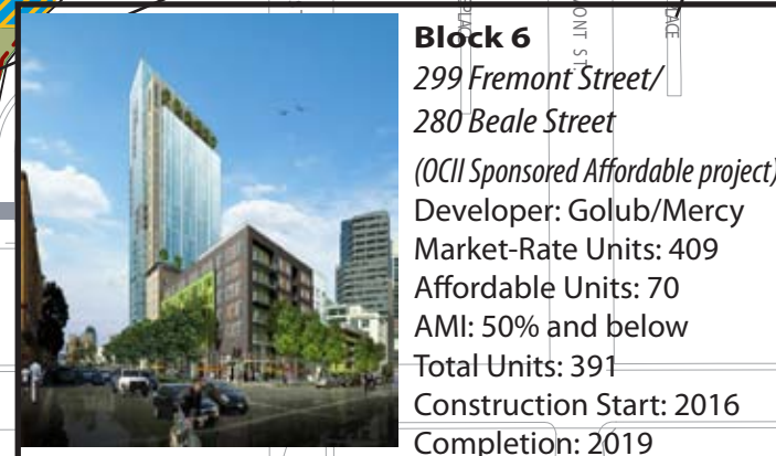
Block 6 299 Fremont Street/ 280 Beale Street (OCII Sponsored Affordable project) Developer: Golub/Mercy Market-Rate Units: 409 Affordable Units: 70 AMI: 50% and below Total Units: 391 Construction Start: 2016 Completion: 2019

Transbay Park (Block 3) Construction to start 2017