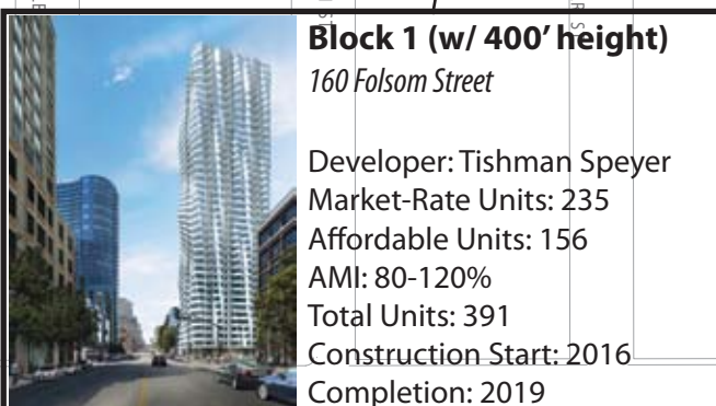
Block 1 (w/ 400' height) 160 Folsom Street Developer: Tishman Speyer Market-Rate Units: 235 Affordable Units: 156 AMI: 80-120% Total Units: 391 Construction Start: 2016 Completion: 2019