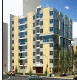
Block 7 255 Fremont Street/ 222 Beale Street Developer: Mercy Affordable Units: 120 AMI: 50% and below Construction Start: 2016 Completion: 2018