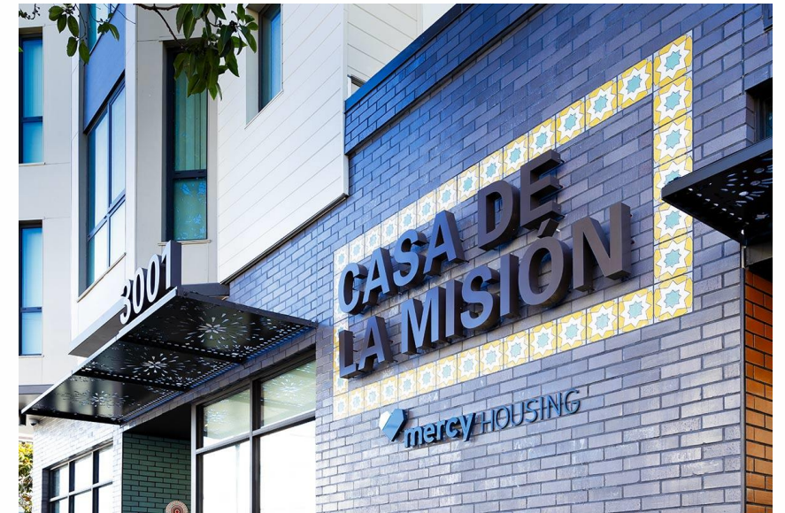
Housing for older adults at Casa de la Misión.