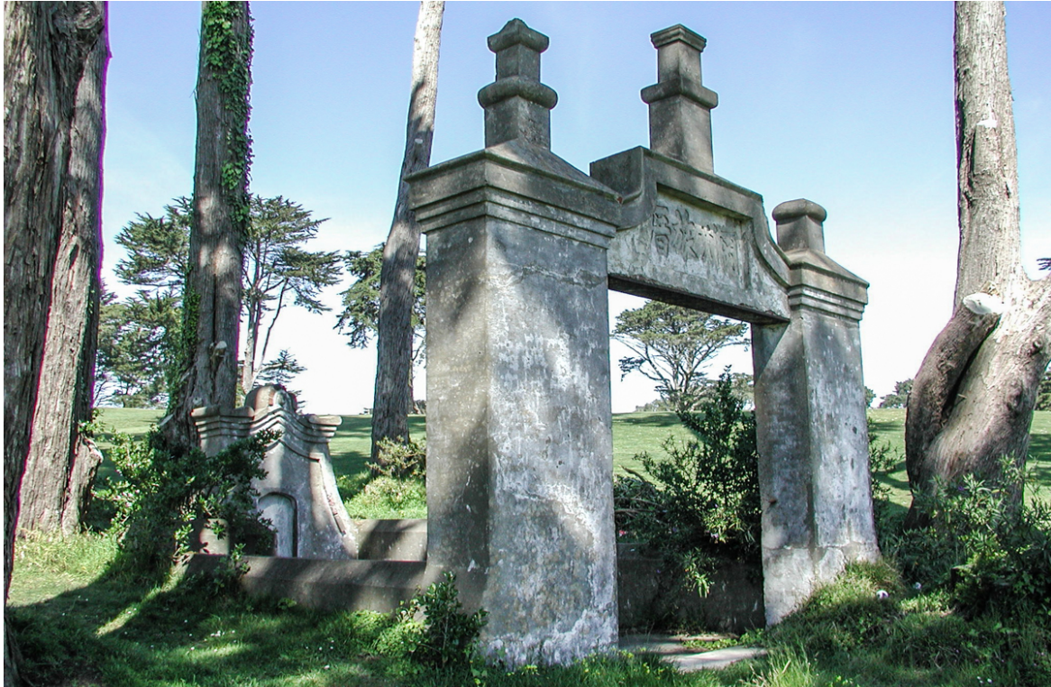
The Kong Chow Funerary Chapel (John Martini)

The Kong Chow Funerary Chapel at Lincoln Park is the sole remnant of a sprawling burial ground used by San Francisco's 19th century Chinese community. Starting in 1877, over a dozen Chinese companies established plots at City Cemetery (also called Golden Gate Cemetery), flanked by the city's indigent burial grounds ("paupers sections") and various fraternal and ethnic plots.