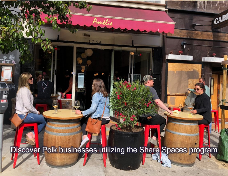
Discover Polk businesses utilizing the Share Spaces program