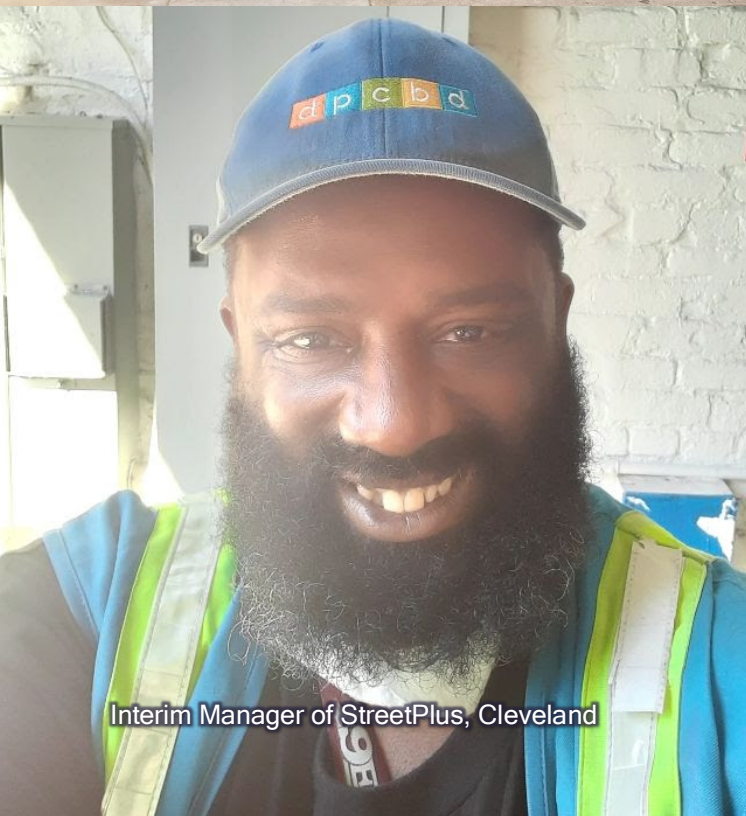
Interim Manager of StreetPlus, Cleveland