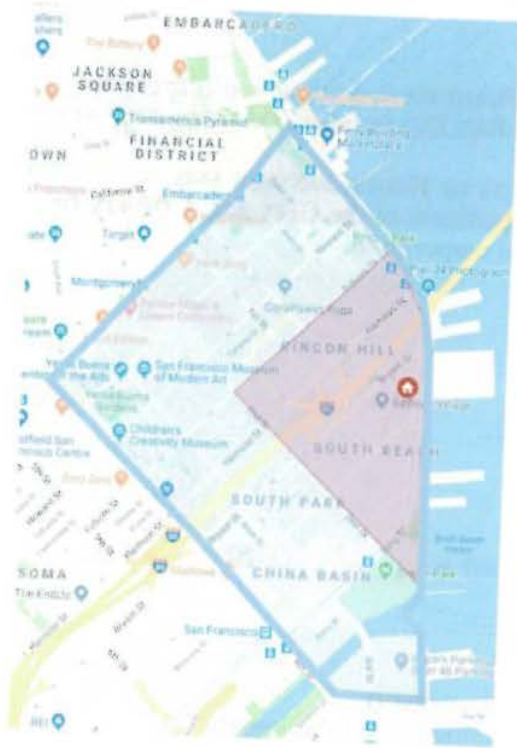
EXHIBIT E OUTREACH ZONE