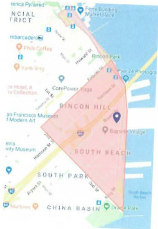
EXHIBIT F SAFETY ZONE