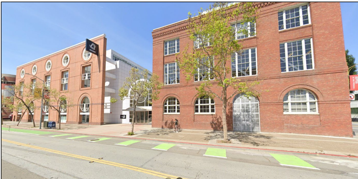
600 Townsend Street, west (left) and east (right) buildings.