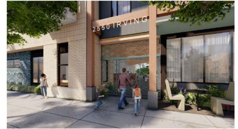
ENTRY PORTAL THROUGH GATE ALONG IRVING