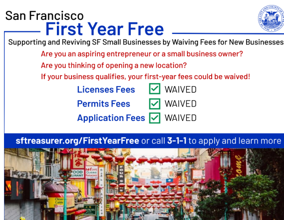
Figure 3: First Year Free Outreach Materials 40