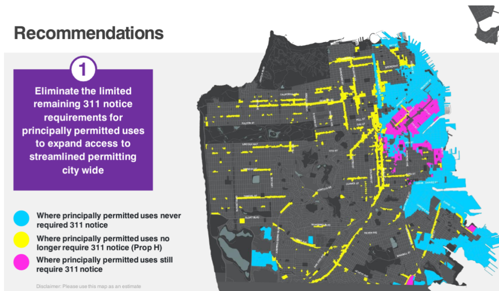
Figure 4: Map Showing 2023 Expansion 62

The Board of Supervisors passed these provisions on April 25, 2023 as part of a package of other zoning changes, and Mayor Breed approved them on May 3, 2023. 63