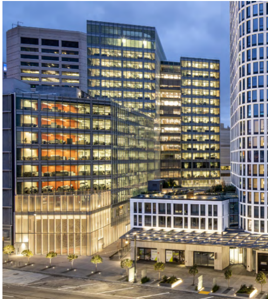
Figure 1: The Permit Center 18

The new Permit Center offers many innovative services. These include an onsite Print Center, and the “QLess” customer notification and online waiting system. The Qless system allows visitors to check Permit Center wait times online, assigns customers to a place in queue with the appropriate department, and reduces customer time at the Permit Center. 19 These innovations are particularly helpful to small business customers, who often lack the time, experience and sophistication that was previously needed to navigate the arcane hurdles of zoning, planning and permitting across multiple departments in different buildings around the City.