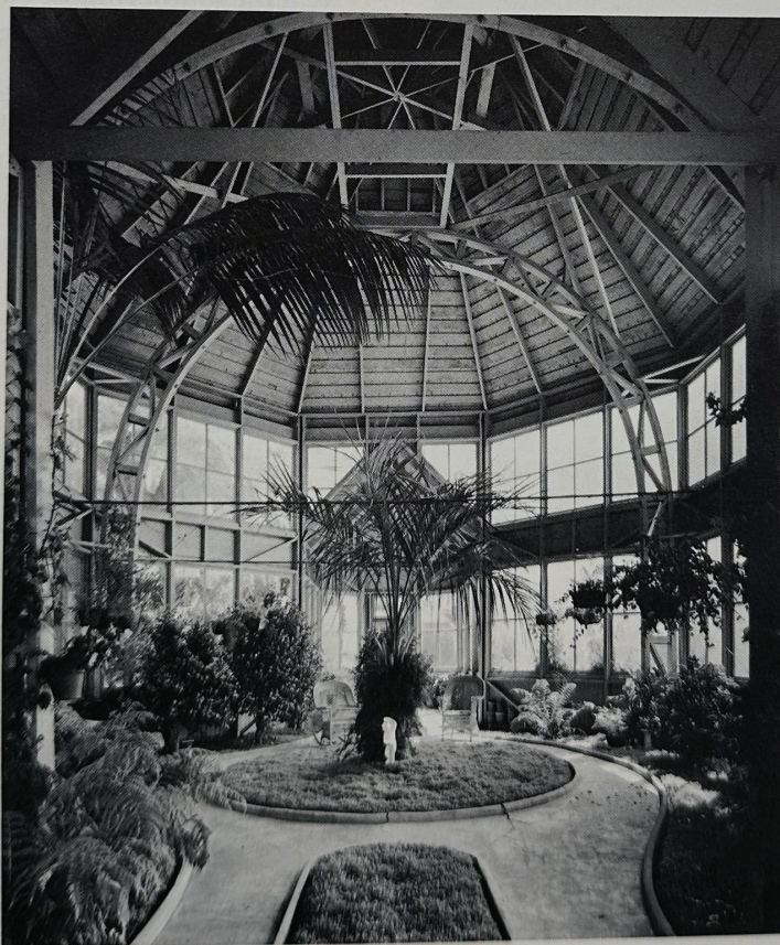
Conservatory interior at 236 Monterey Blvd.