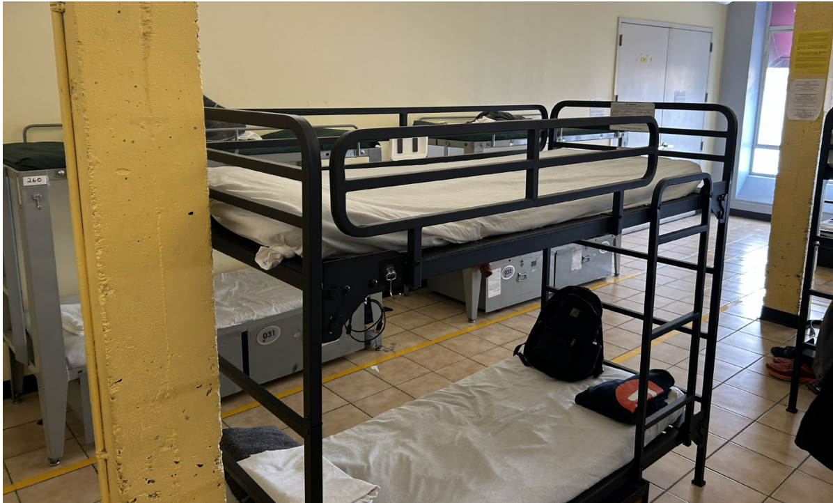
Photos: bunk beds in the congregate shelter MSC South