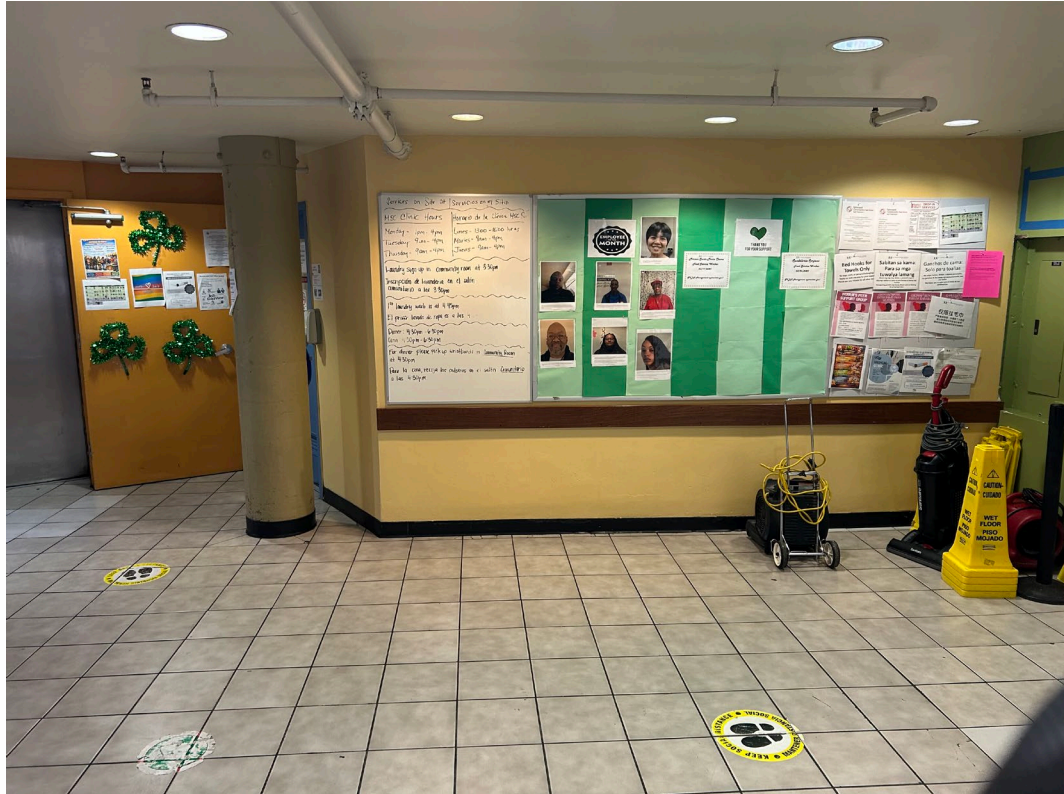
Photos: Front desk and lobby at MSC South