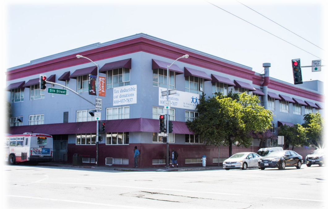
Photo: Exterior of MSC South