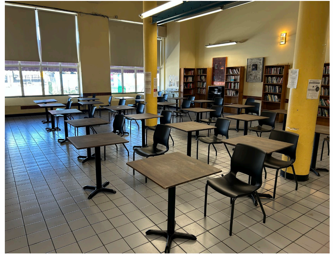
Photos: Community room computers and desks at MSC South