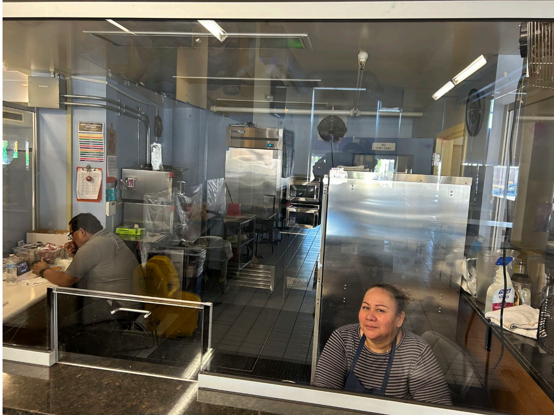
Photos: kitchen and cafeteria seating at MSC South