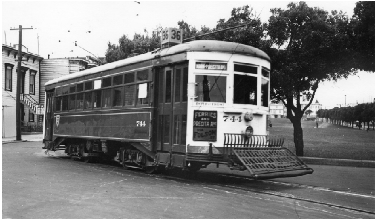
Alabama & Precita, 1937. View West, 36-Line #744 on Alabama at Precita. Subject property is at the left.

Staff finds that due to its date of construction and architectural integrity, the front building at the subject property is contributory within the Eligible Bernal Heights North Historic District.