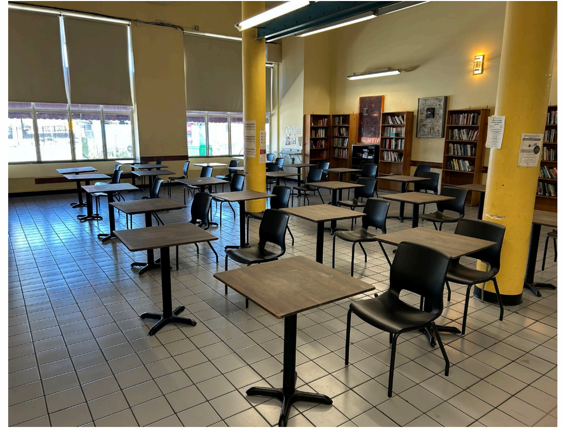
Photos: Community room computers and desks at MSC South