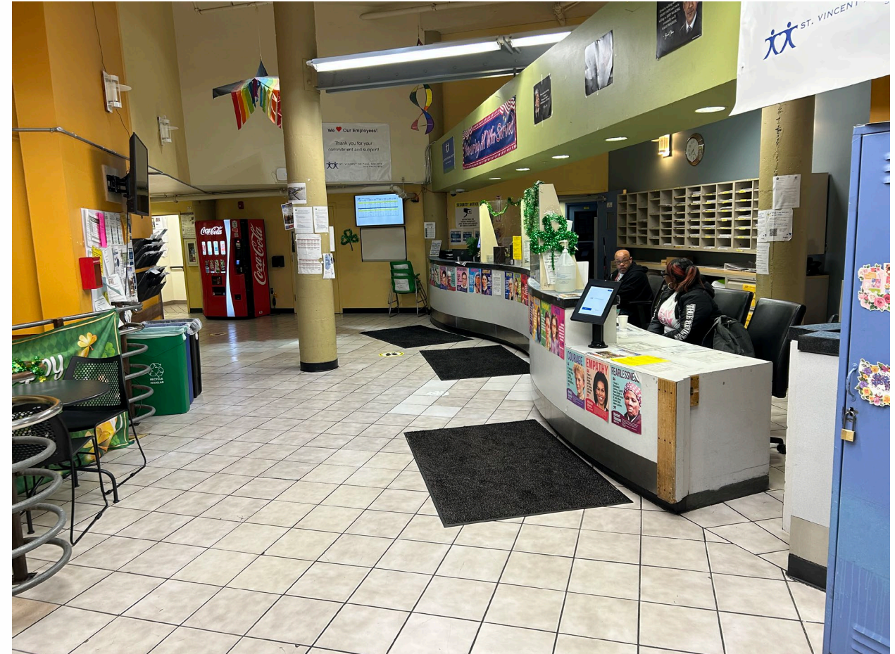
Photos: Front desk and lobby at MSC South