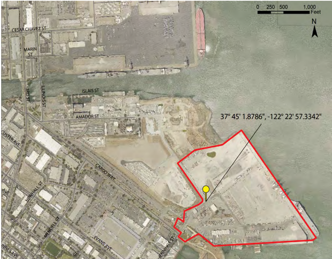
EXHIBIT A Area of Work Identified in Grant Application