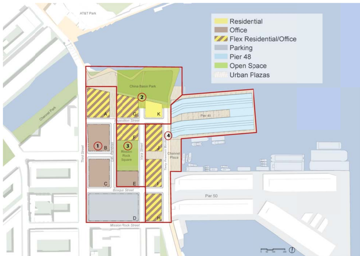
Figure 1: Proposed Mission Rock Project

Under the proposed term sheet, Seawall Lot 337 Associates or an affiliate would construct a mixed use development balancing residential, office, retail, exhibition, and parking uses distributed over a network of newly constructed city blocks. In addition, Seawall Lot 337 Associates, or an affiliate, would develop three parks and open spaces totaling eight acres. Figure 1 and Table 2 below summarize the proposed uses.