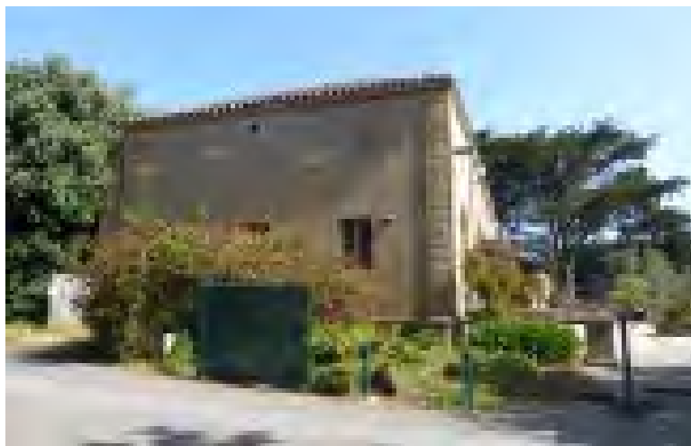
Mother's Building, north elevation (L) and south elevation (R), 2015.