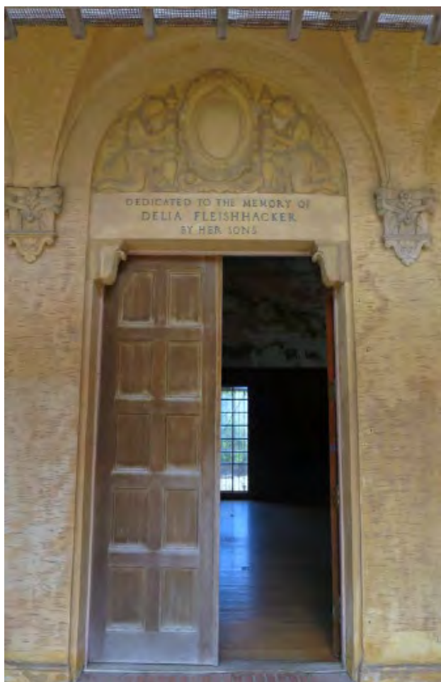
Mother's Building, main entrance, view west, 2016.