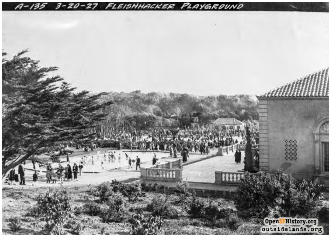
Fleishhacker Playground with north elevation of Mother's Building at right, March 20, 1927.