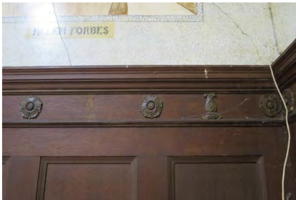
Mother's Building, detail of metal motifs at wainscoting in main lounge, 2016.