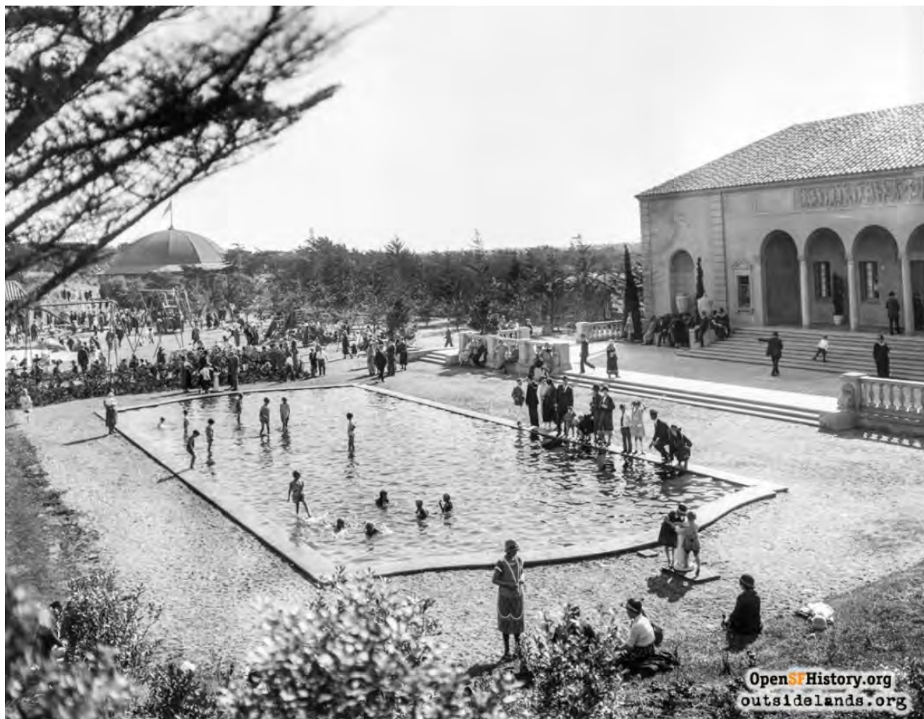
Wading pool in front of Mother's building, carousel and playground in background, circa 1925.