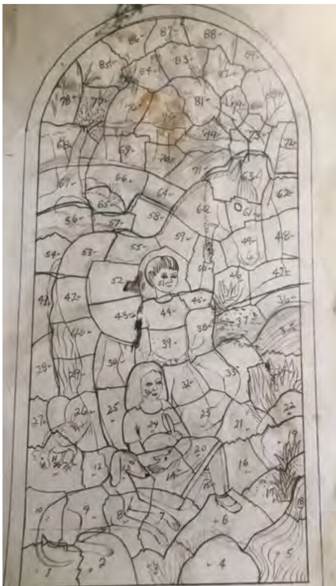
Preliminary drawing for Children and Their Animals , 1934.