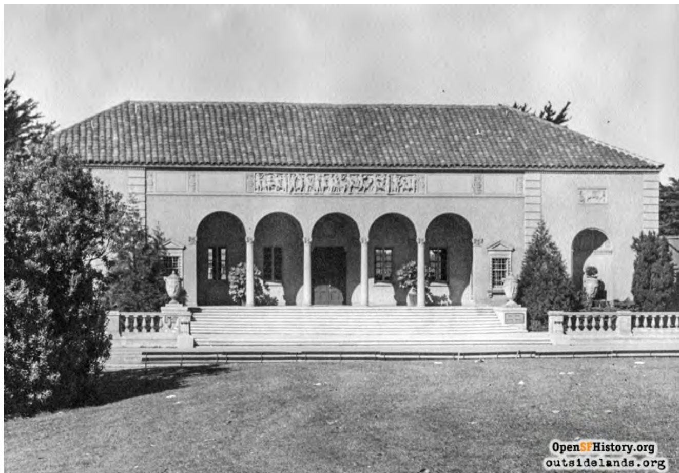
Mother's Building, east elevation, view west, circa 1940.