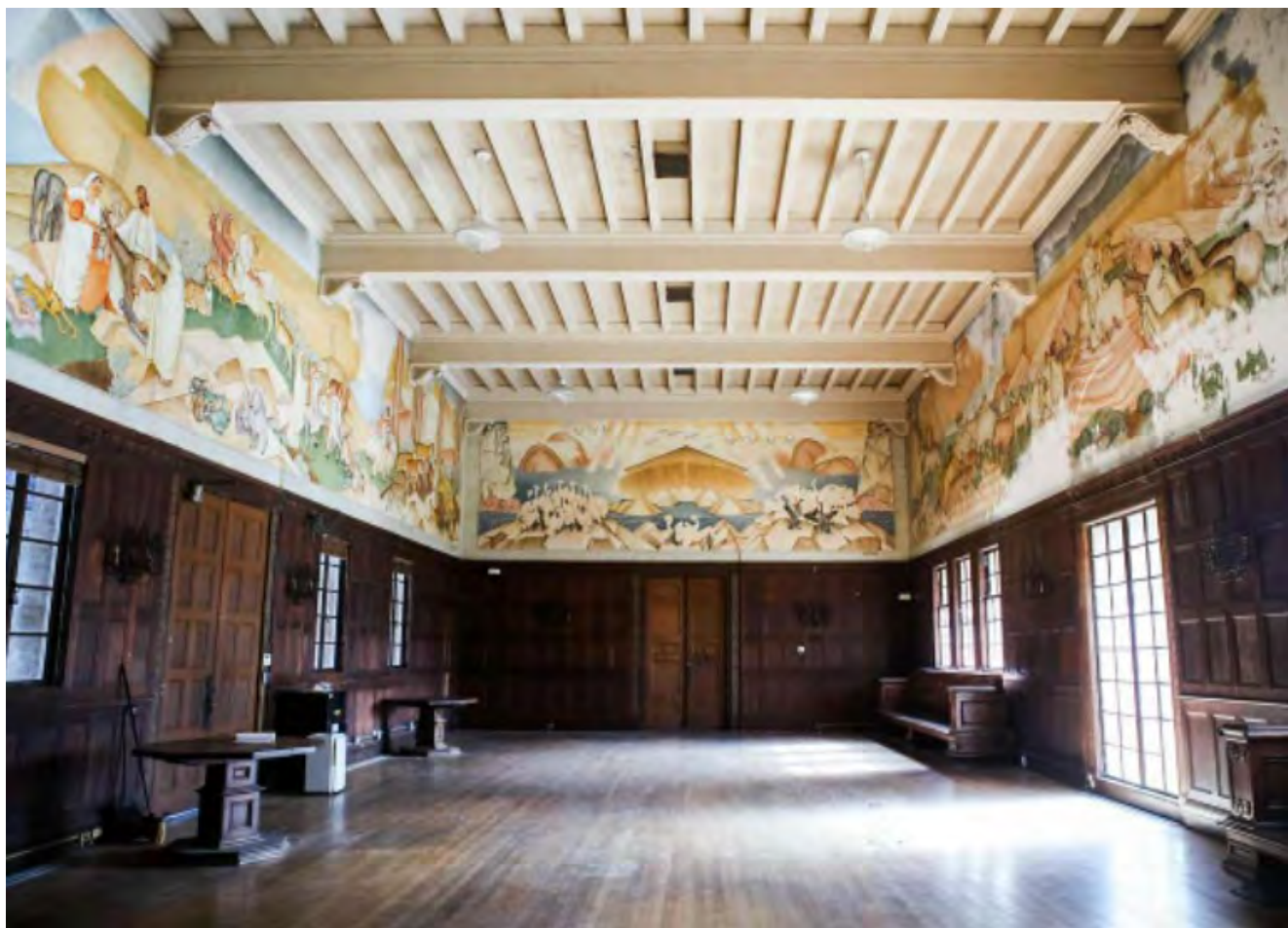
Mother's Building, main room with murals depicting scenes from Noah's Ark, view north, 2016.