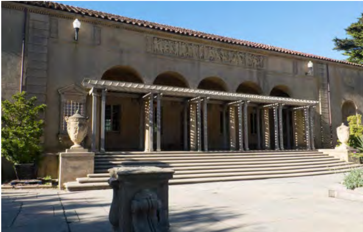
Mother's Building, east façade