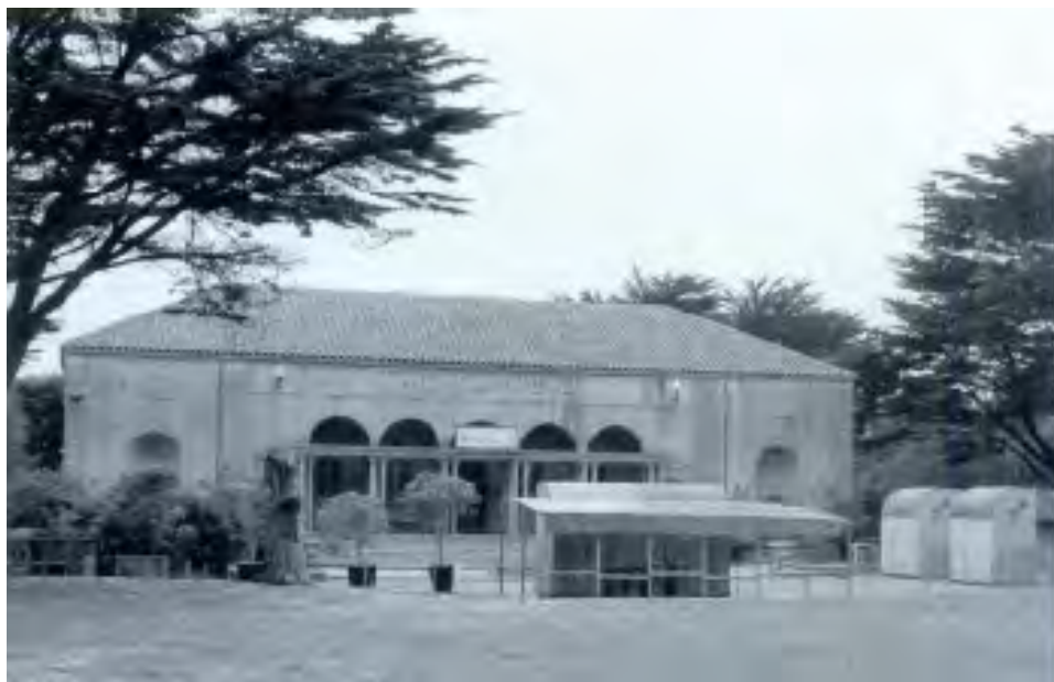
Mother's Building, east elevation, view west, circa 1990.