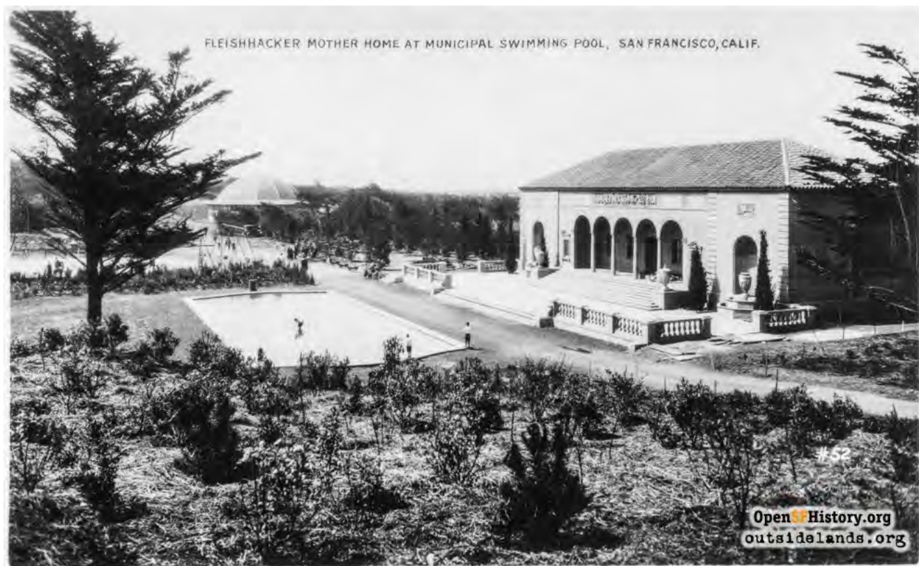
Mother's Building with playground and wading pool and merry-go-round in background, circa 1925.