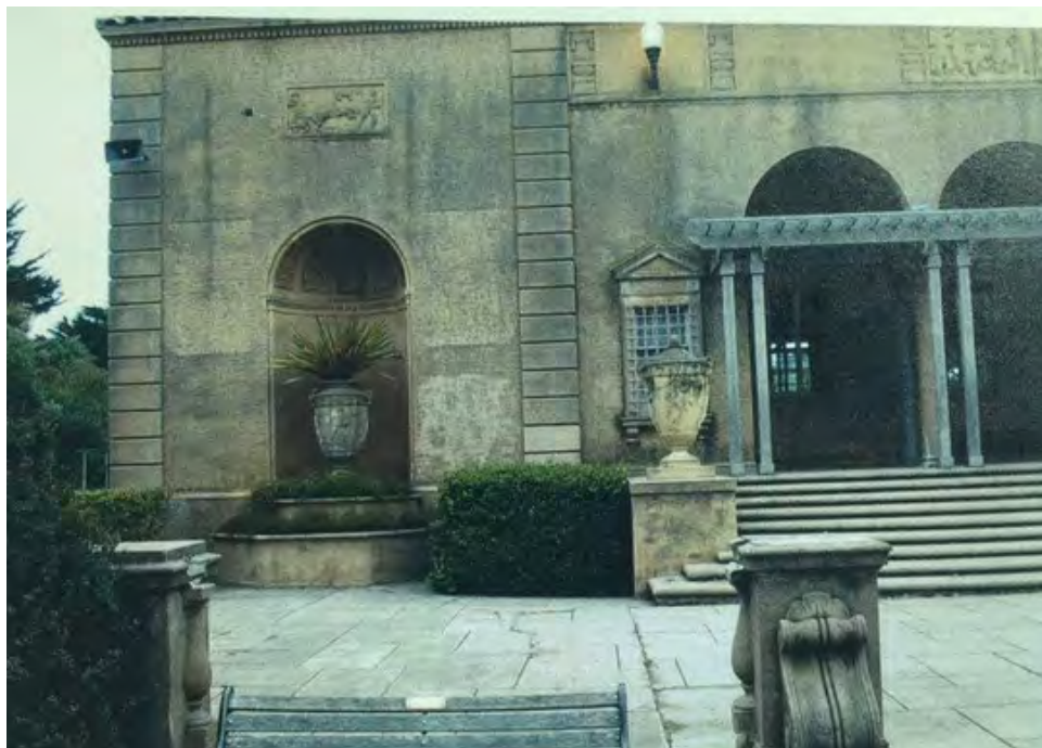
Mother's Building, side bay at east elevation, circa 2005.