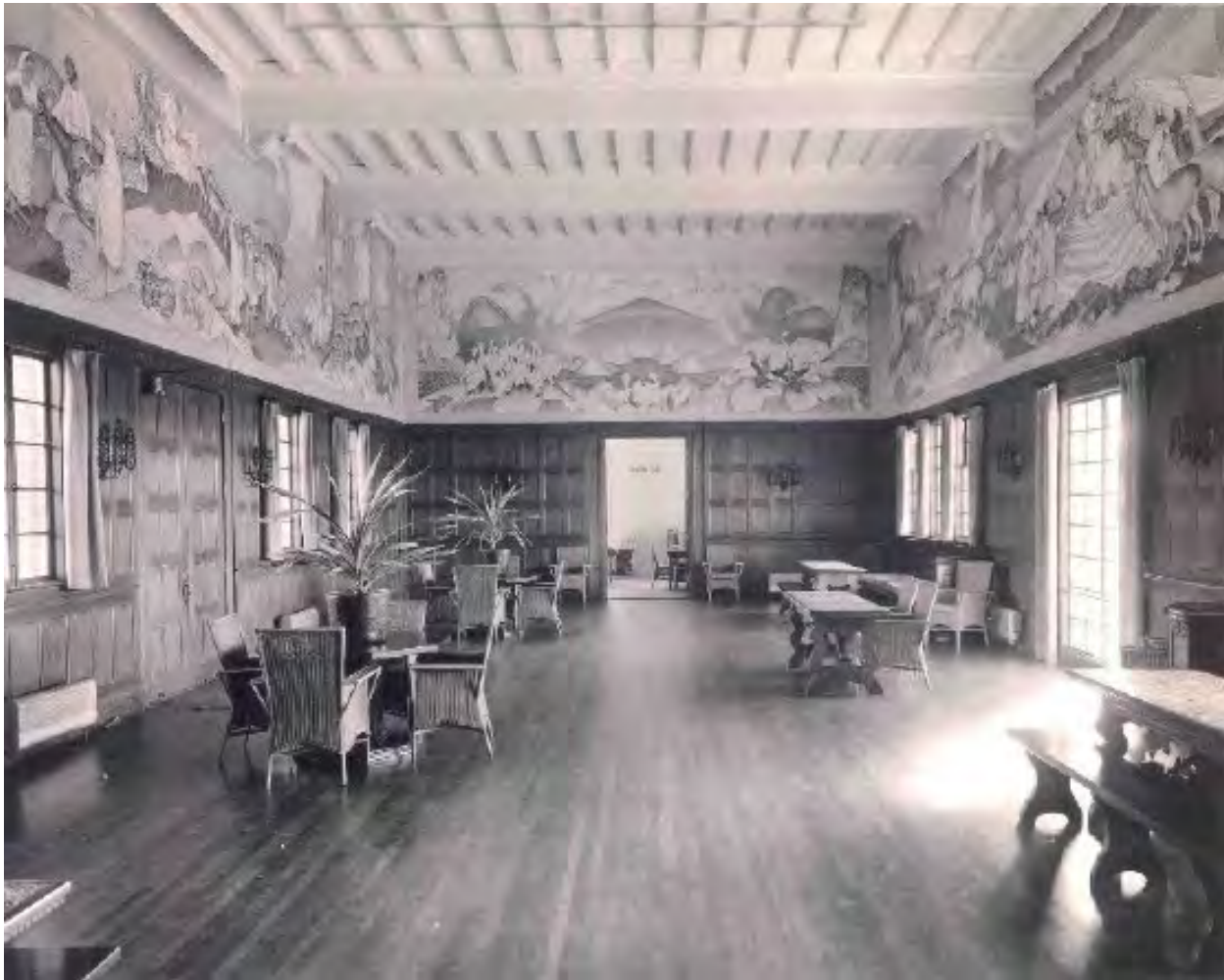
Mother's Building, main lounge, view north, 1939.