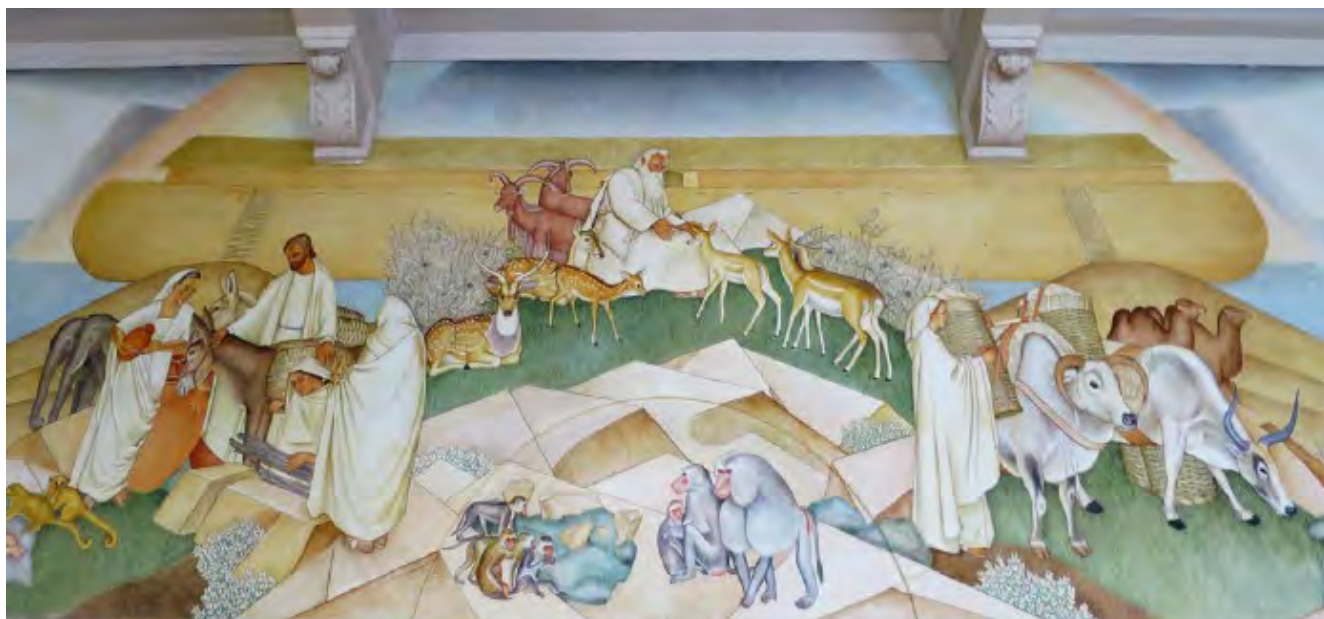
Mother's Building, The Ark's Passengers Disembark on east wall of main lounge, 2016