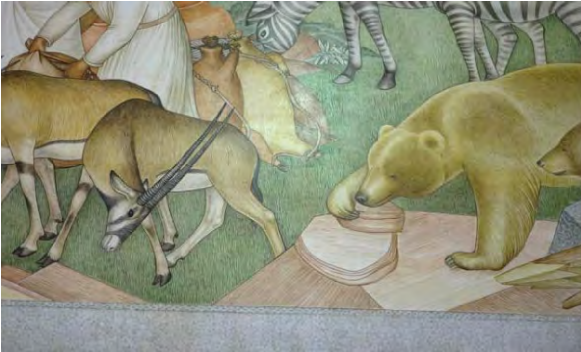
Mother's Building, west wall of main lounge, detail from Loading of the Animals , 2016.