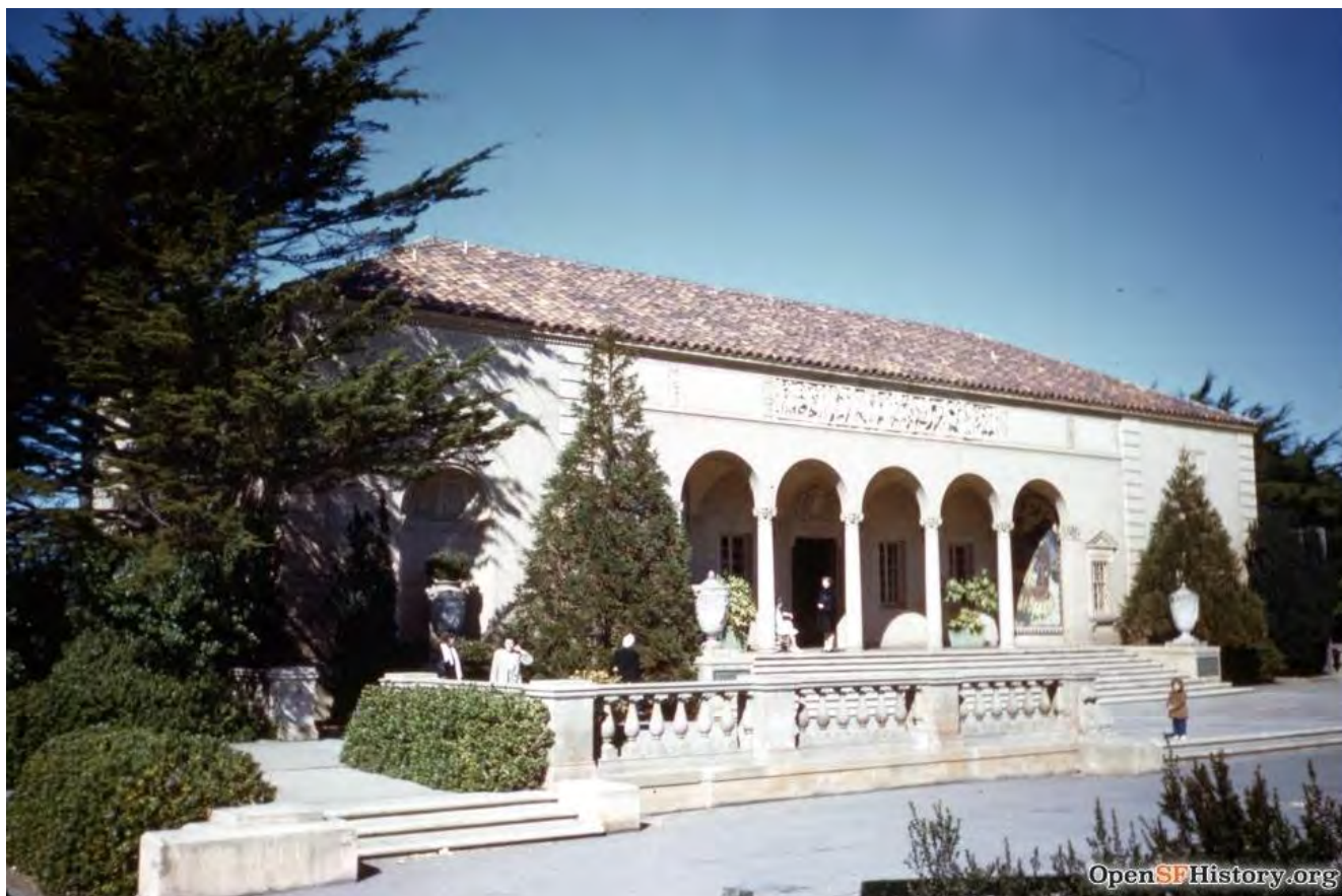
Mother's Building, east elevation and terrace/plaza, view northwest, circa 1945.