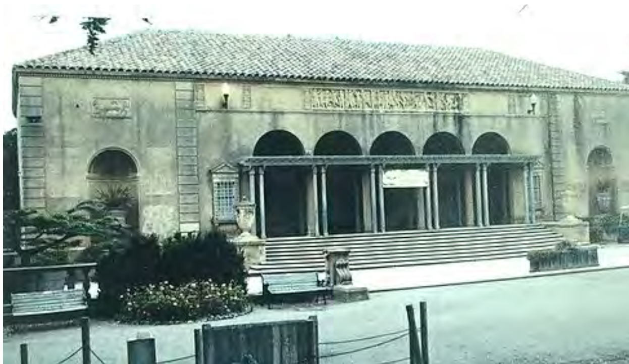
Mother's Building, east elevation, view west, circa 2005.