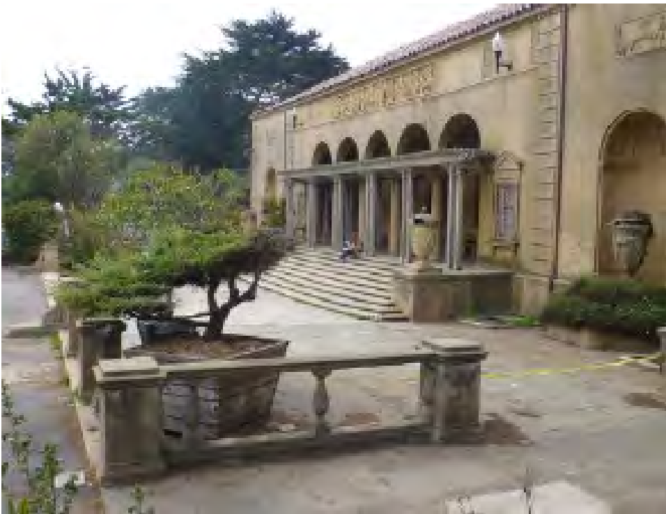
Mother's Building, east elevation and terrace/plaza, view south, 2015.