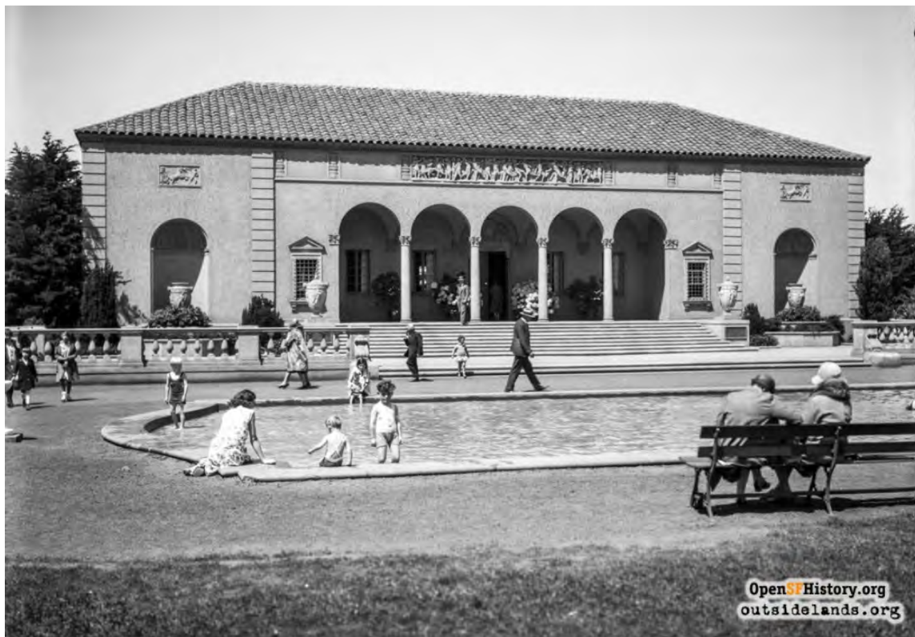
Mother's Building and wading pool, circa 1934