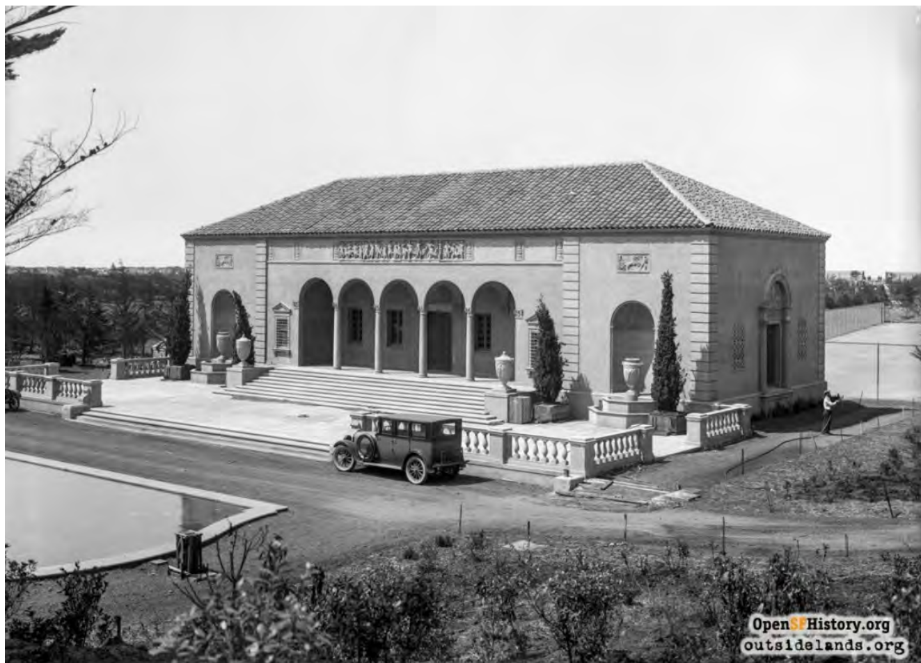
San Francisco (Fleishhacker) Zoo. Newly completed Mothers Building at what was then Fleishhacker Playground. 1925