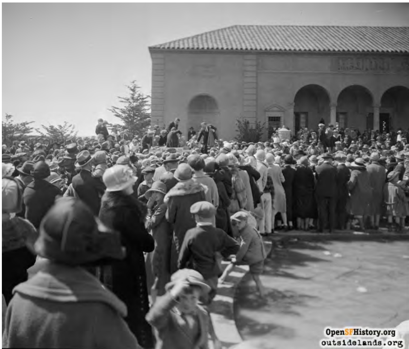
Mother's Building in background of crowd gathered for Easter Egg Hunt at Fleishhacker Playground, April 11, 1926.