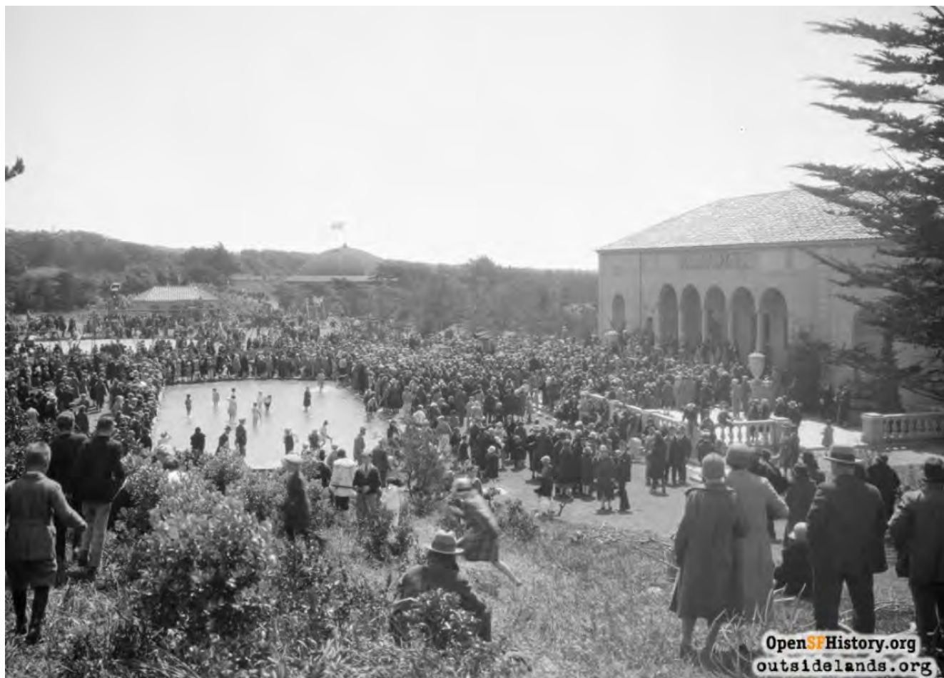
Easter Egg Hunt at Fleishhacker Playground, near Sloat Blvd & 45th Ave. Overall view looking south of crowds, wading pool, swings, merry go round. Mother's Building at right. April 11, 1936