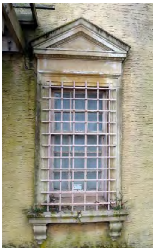
Mother's Building, window and surround, 2016.