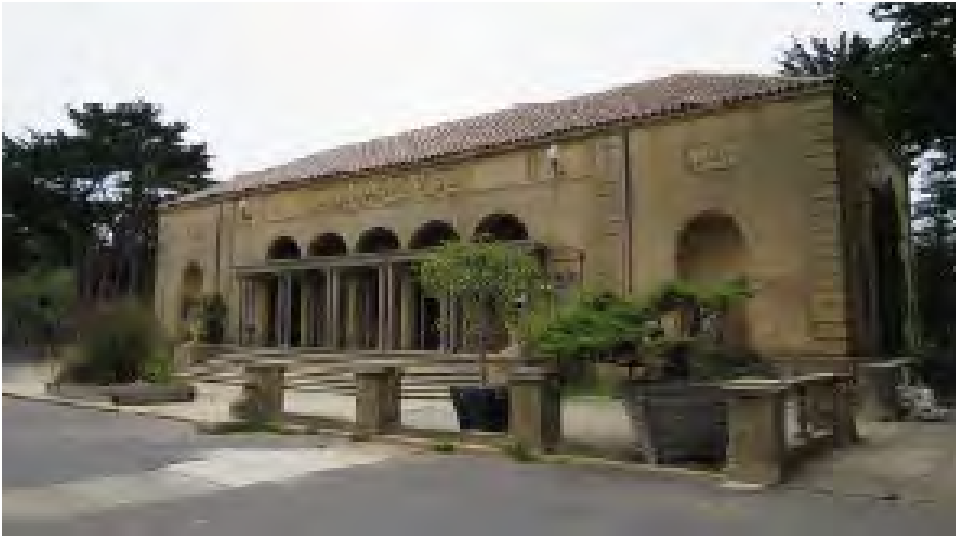
Mother's Building, east elevation and terrace/plaza, view southwest, 2015.