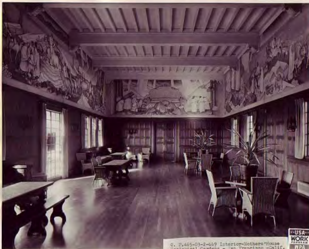
O. P. 465-03-2-669 Interior-Mothers' House Zoological Gardens - San Francisco - Calif.