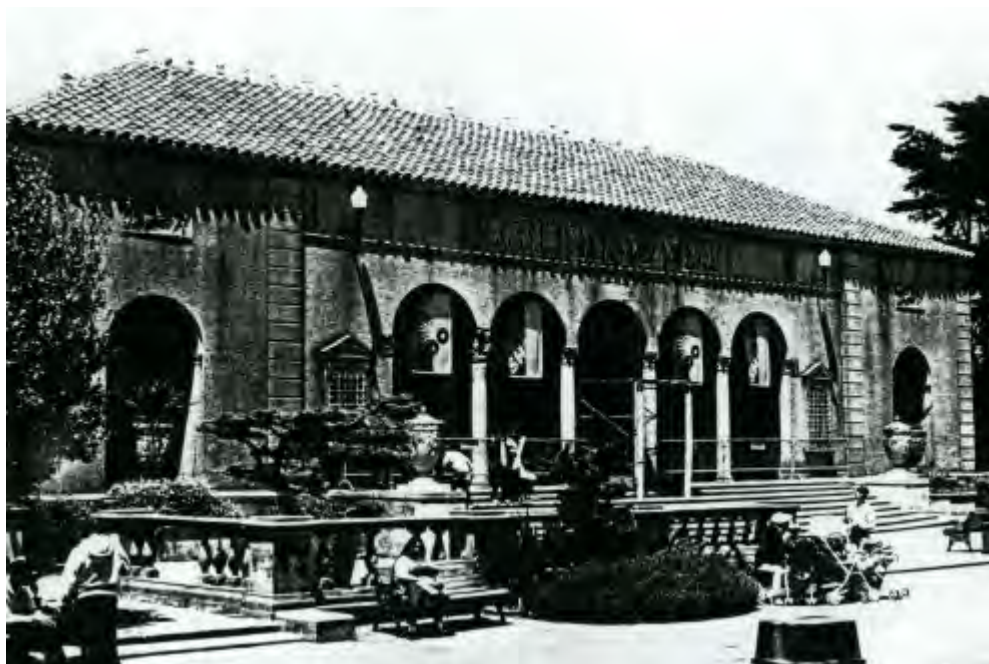
Mother's Building, east elevation, circa 1996.