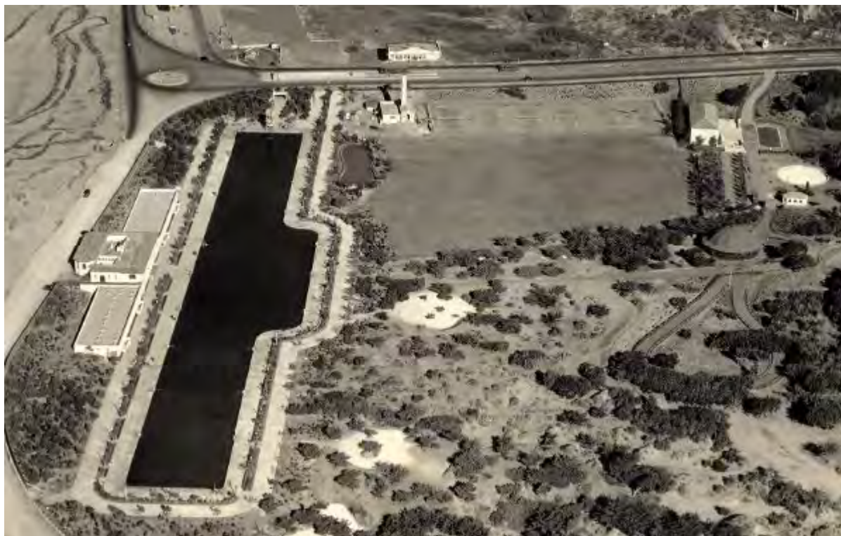
Fleishhacker Pool, aerial view, Dec. 5, 1925. Mother's Building at upper right corner.