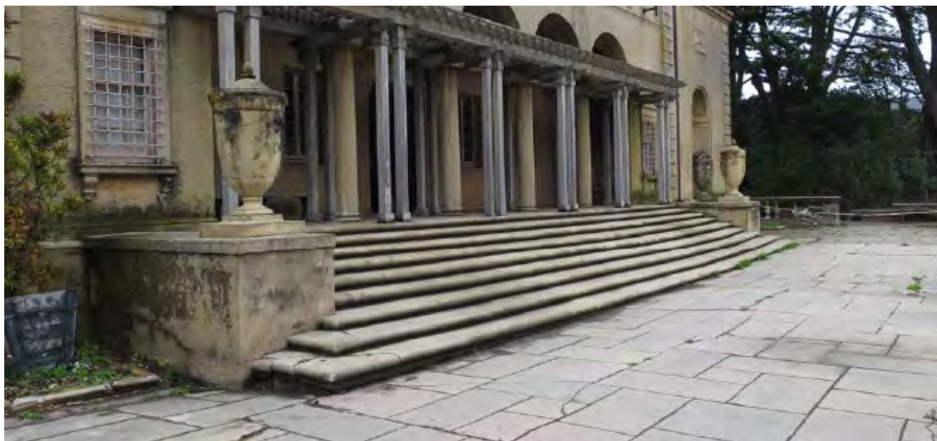
Mother's Building, terrace/plaza and entrance stairs at east elevation, view northwest, 2016.