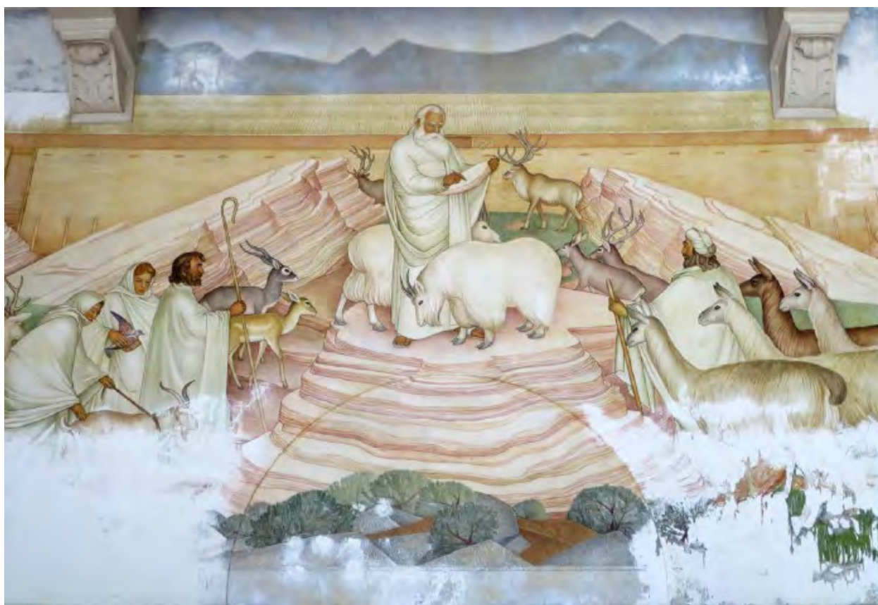
Mother's Building, west wall of main lounge, detail of Loading of the Animals , 2016.