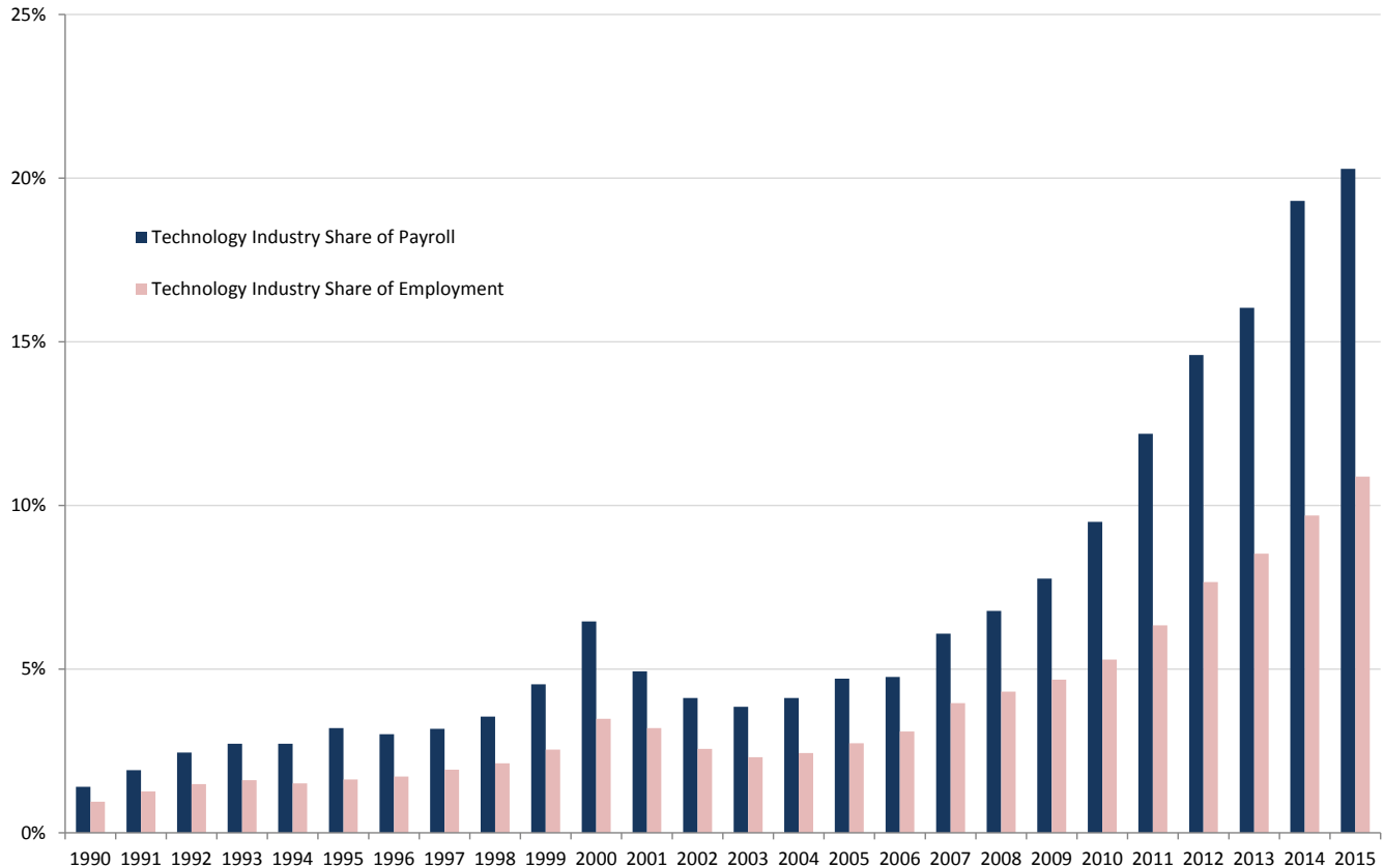
Technology Industry Share of Private Sector Payroll and Employment in San Francisco, 1990-2015

During this decade, the Technology sector has transformed San Francisco's economy. The sector's share of the city's total private sector payroll and employment has more than doubled in the five years from 2010 to 2015.