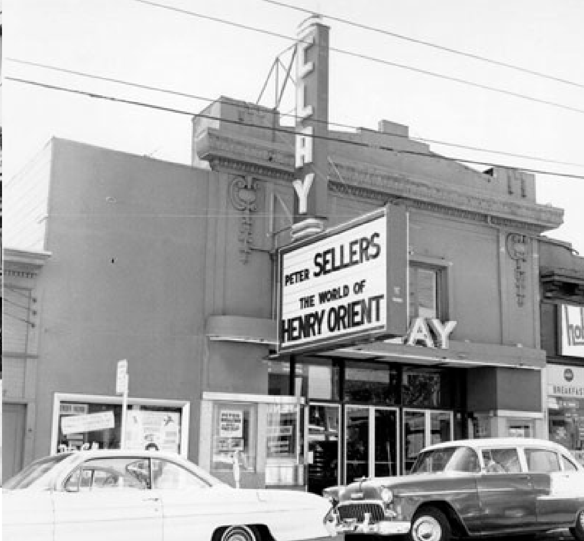
Clay Theatre, 1964

http://sflib1.sfpl.org:82/record=b1003696