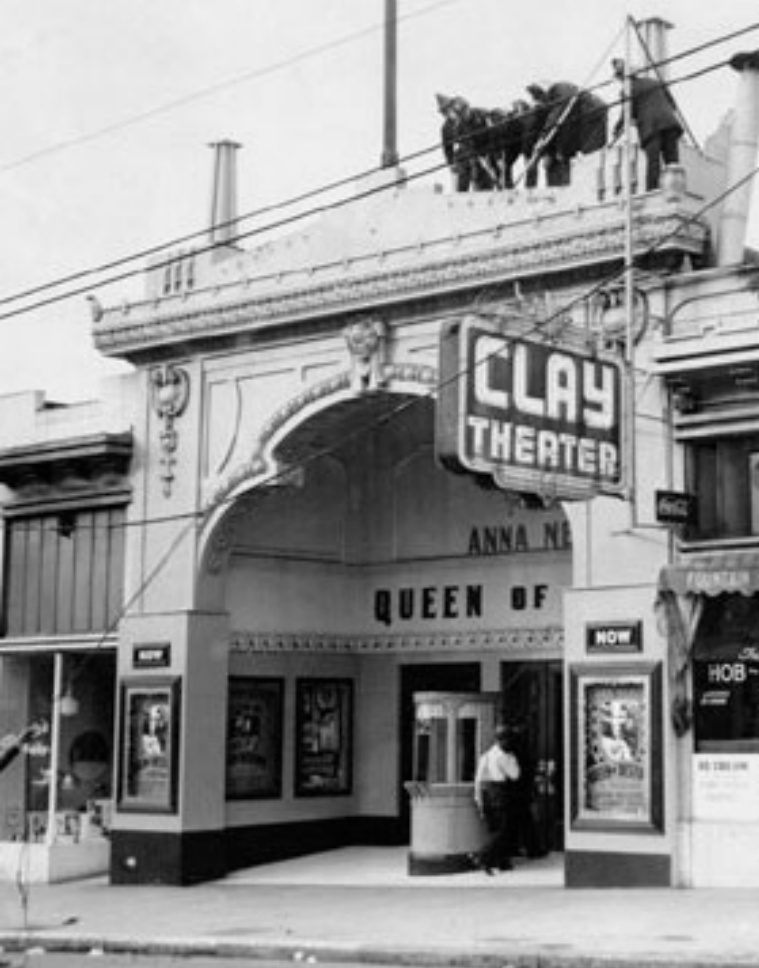
Clay Theatre (original façade), October 7, 1940.