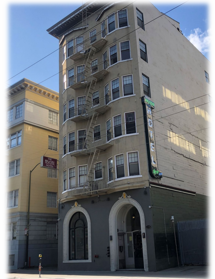
Photo: Abigail Hotel, Exterior