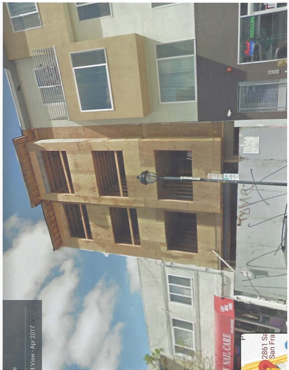
#7 Original Building 2861-2863 San Bruno Ave