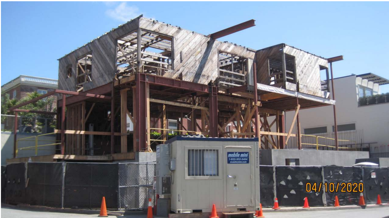
#3.JUST PRIOR TO COMPLETION