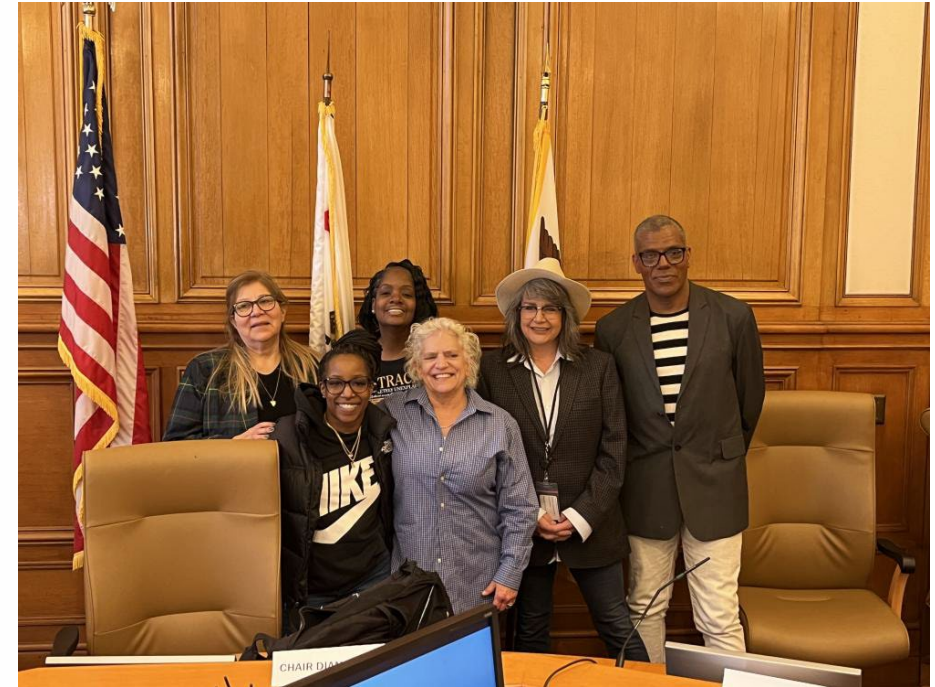
Shelter Monitoring Committee | March 2024

For more information, please visit: https://www.sf.gov/departments/shelter-monitoring-committee