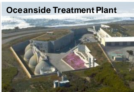
Oceanside Treatment Plant

Avg. DWF: 12mgd Wet Weather Cap.: 175mgd