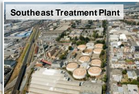
Southeast Treatment Plant

Avg. DWF: 58mgd Wet Weather Cap.: 250mgd