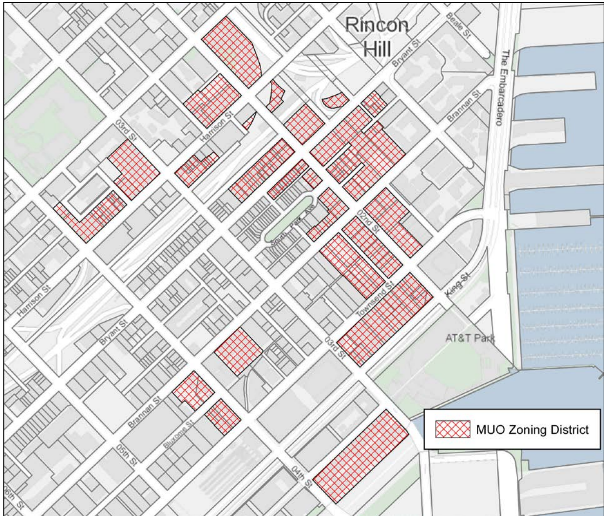
This zoning map shows the location of the MUO Zoning District within the SoMa area.

Height designations within the MUO range from 45' to 130', with the majority of the parcels mapped at 65'. The highest height designation – 130' – is limited to the east, and a portion of the west, sides of 2 nd Street between Harrison and Folsom Streets. The 105' height designation is located on the block bounded by 2 nd , 3 rd , Townsend, and King Streets, across from AT&T Park. On this block, there is a parcel located at 144 King Street, for which a hotel that is greater than 75 rooms has been proposed.