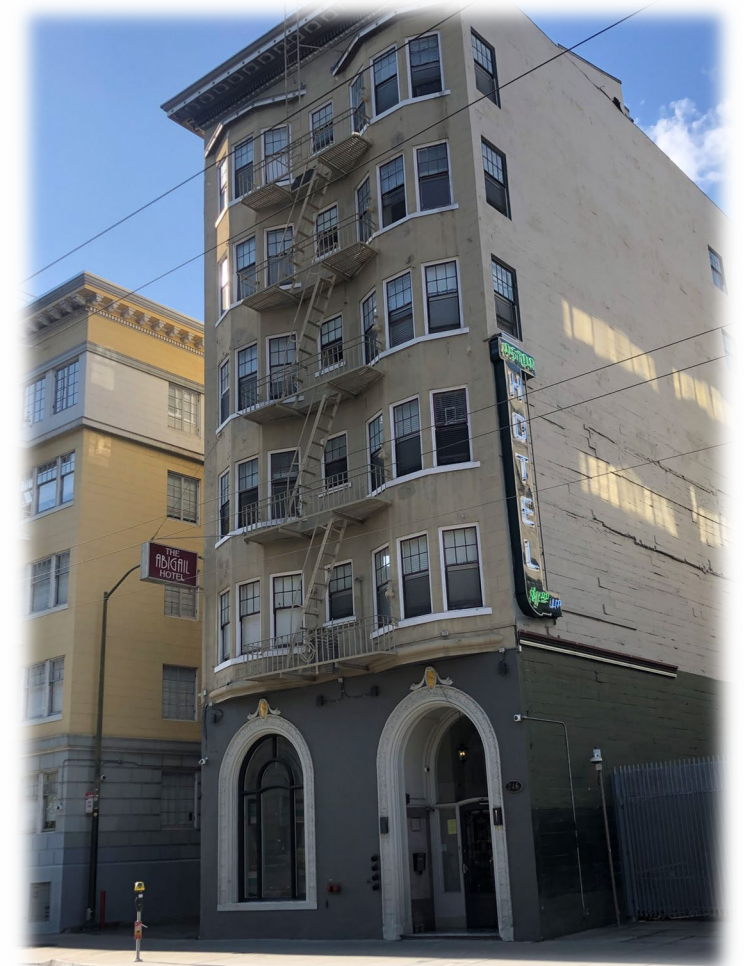
Photo: Abigail Hotel, Exterior