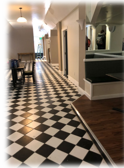
Photo: Lobby, Abigail Hotel