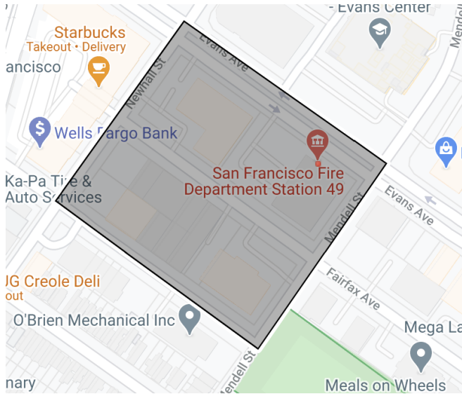
[Image description: The image shows a screenshot of the Fire Department Station 49 building.]