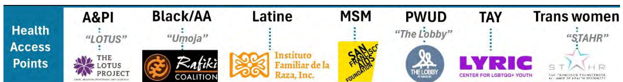
Exhibit 2: San Francisco Health Access Points

In 2023, SFDPH implemented a new service model as part of the shift to a syndemic SDOH-focused approach—Health Access Points ( HAPs ) ( Exhibit 2 ). The HAPs, funded and overseen by the Community Health Equity and Promotion ( CHEP ) Branch, are an integrated, low-barrier HIV/HCV/STI service model, where each HAP delivers services for a specific priority population. Each HAP (lead agency and priority population shown in Exhibit 2 ) is required to provide 13 standards of care ( Exhibit 3 ). A key priority for this project period is to nurture and grow the HAPs into fully functioning “one-stop shops.” This overview of the HAPs is provided here because many of the activities described later in this section relate to the HAPs.