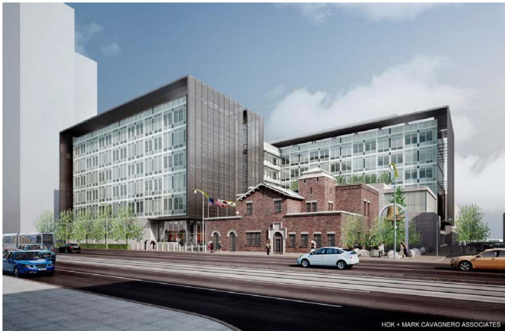
Planned Public Safety Building in Mission Bay

On June 8, 2010, voters of San Francisco approved Proposition B, which authorized the issuance of $412,300,000 of Earthquake Safety and Emergency Response (ESER) General Obligation Bonds. The single largest project under the $412,300,000 ESER General Obligation Bonds is the construction of a new $243,000,000 Public Safety Building in the South Redevelopment Project Area in Mission Bay. This new Public Safety Building will provide (a) a new Police Headquarters, including a new Southern District Police Station, which are both currently located in the Hall of Justice, and (b) a new Mission Bay Fire Station. The new Public Safety Building project is being managed by the Department of Public Works (DPW). Also part of the project is the rehabilitation of historic fire station #30 which will be repurposed as the new location at Mission Bay of the Fire Department's Arson Task Force Unit and which will also contain a community meeting room.