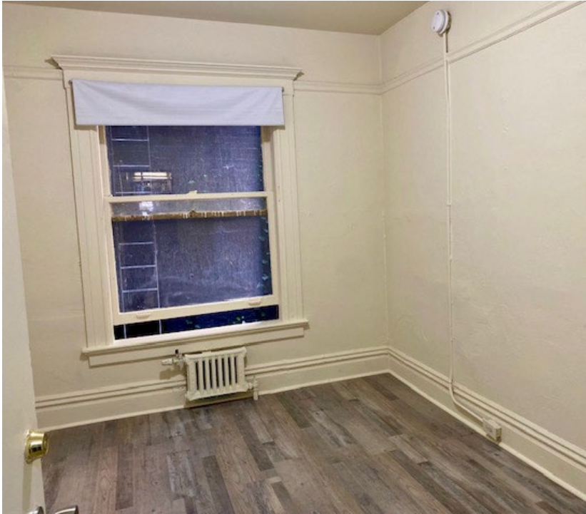
Tenant room at the Elm Hotel