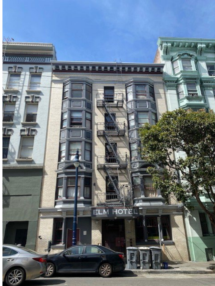
Exterior of the Elm Hotel