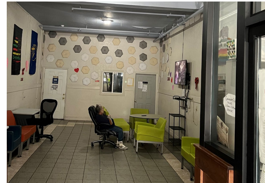
Common Area at the Alder Hotel