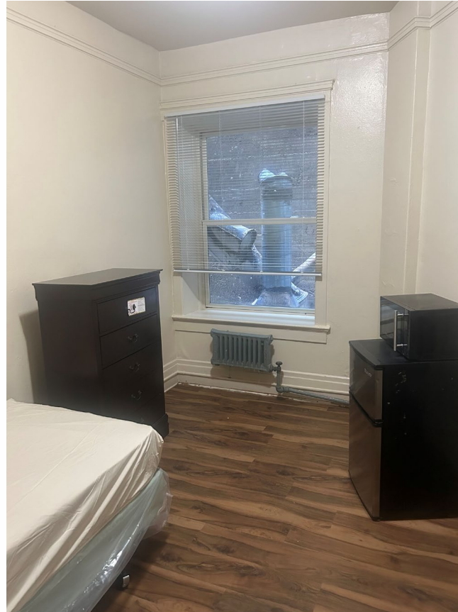
Tenant room at the Crosby