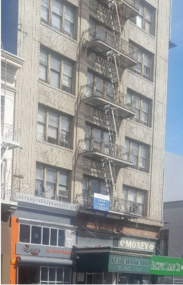
Exterior of the Hillsdale Hotel