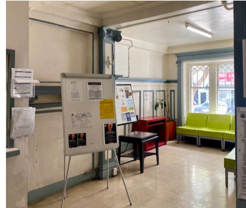
Common Area of the Elm Hotel