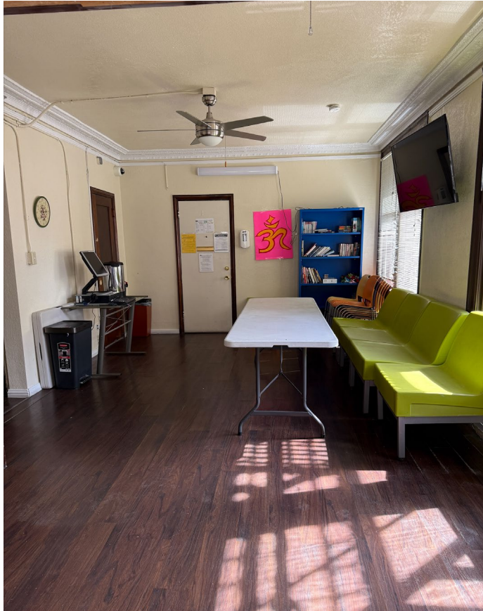
Common Area at the Mentone