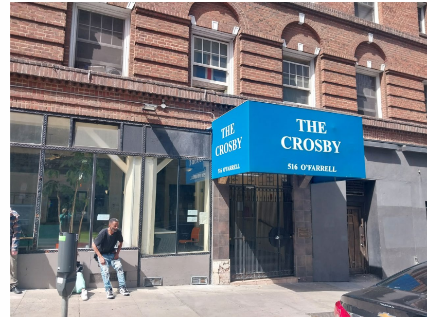
Exterior of the Crosby Hotel