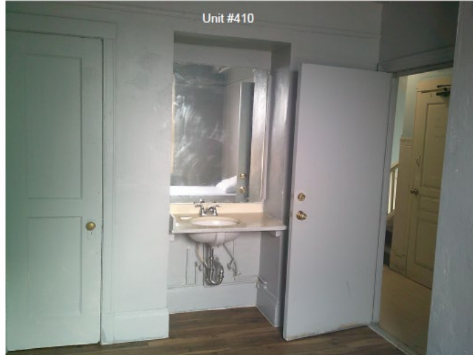
Tenant room at the Hillsdale