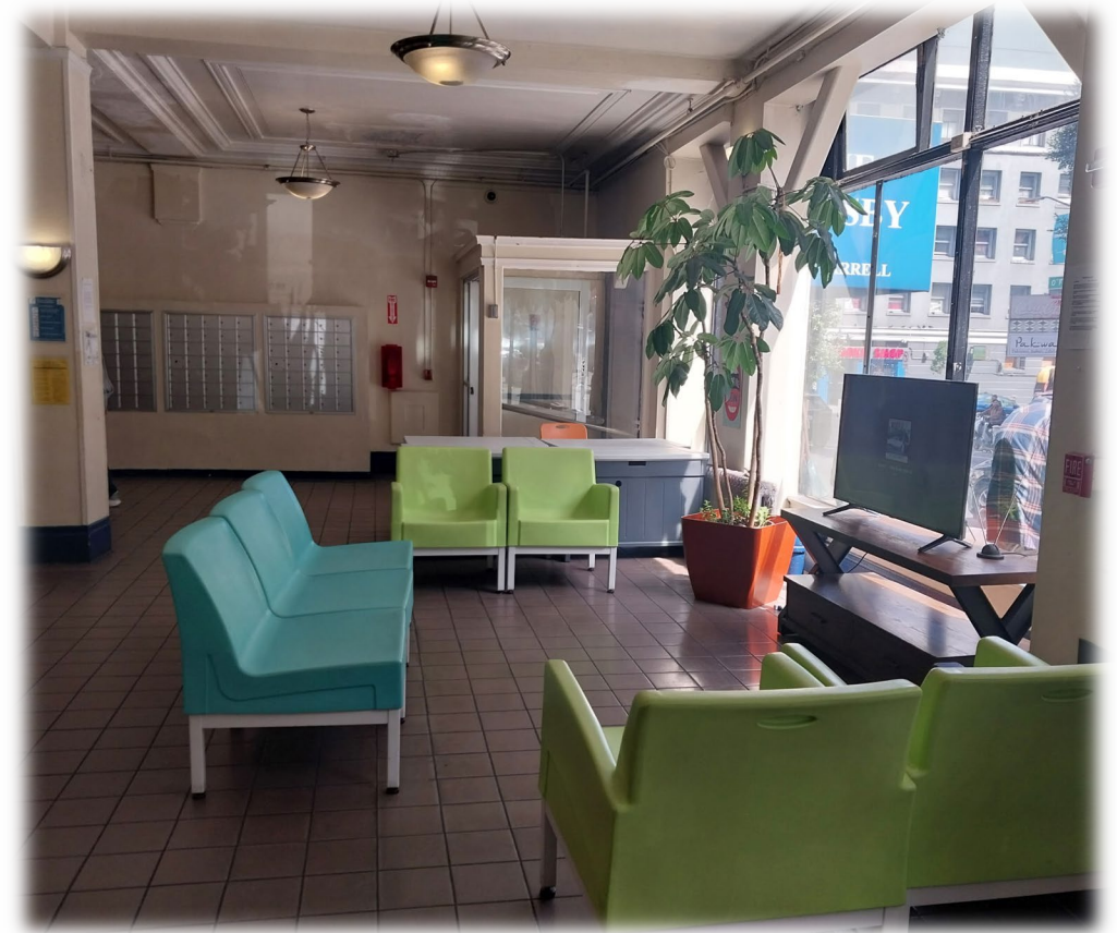
Pictured: Crosby Hotel common area