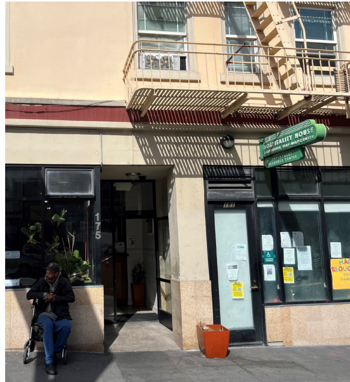
Exterior of the Alder Hotel