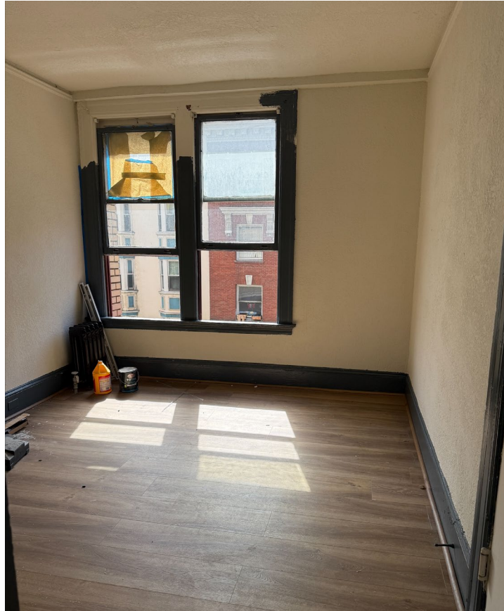
Tenant room at the Mentone