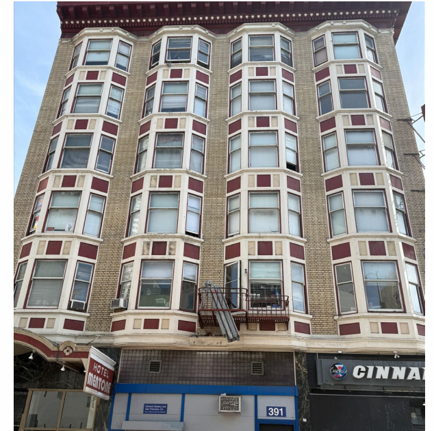
Exterior of the Mentone Hotel