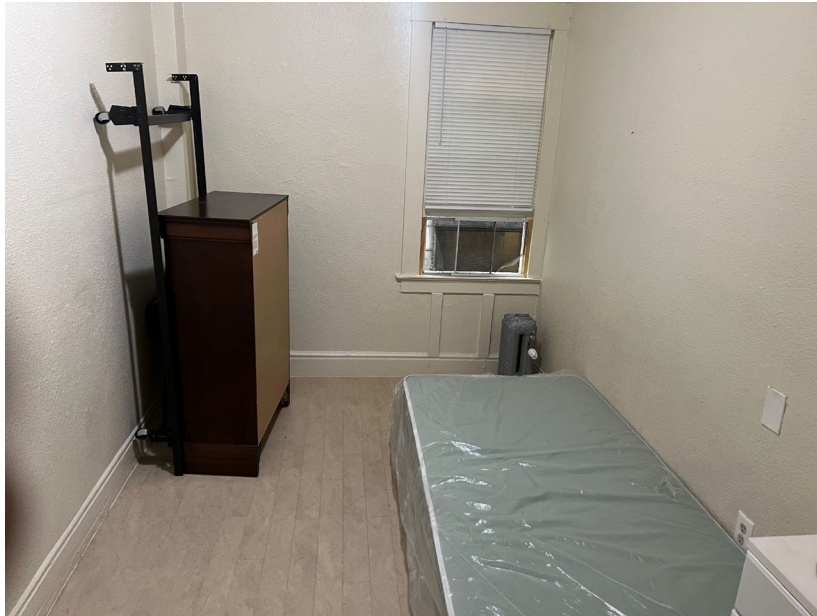
Tenant room at the Alder Hotel