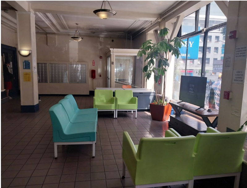
Common Area at the Crosby Hotel