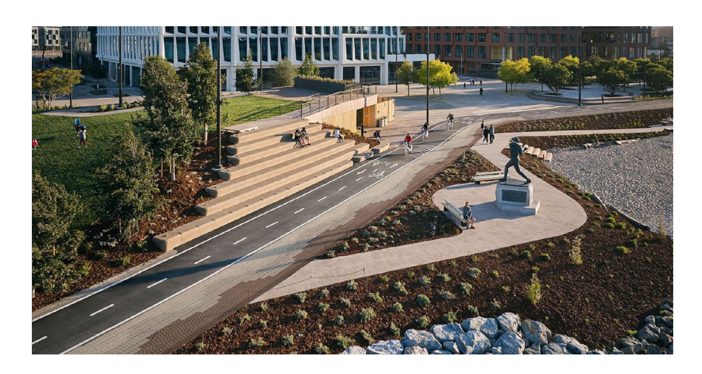
EXHIBIT D Bay Trail Commemorative Paver Design Concept and Proposed Location