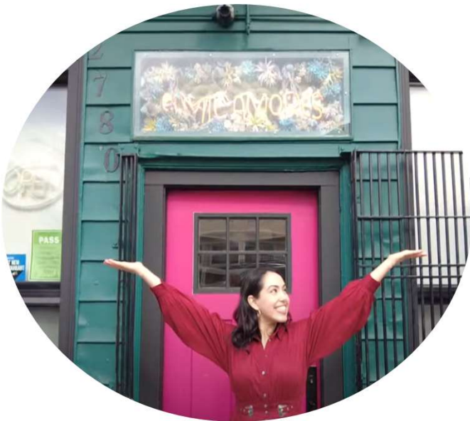
El Mil Amores, located at 2780 21st St. In the Mission District, saved $11,000 in waived fee through the First Year Free Program.