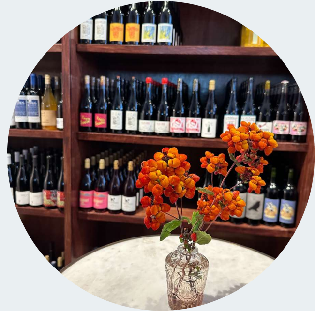
Tala Wine, located at 4625 Mission St in the Excelsior district, opened in May 2023 and benefitted from the First Year Free Program.

“When I first started my online wine club and shop, opening a physical location was a dream, but also a risk. First Year Free saved my business thousands of dollars while we were renovating our space and preparing to open. It helped give me an edge as Tala Wine got up and running.”