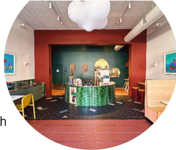
Mamahuhu, 3991 24 St, Noe Valley