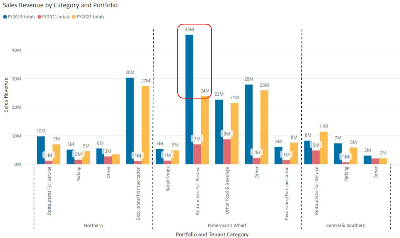
Figure 1. Comparison of Gross Sales FY 2019-2021-2023, Fiscal Year to Date

with sales at Fisherman’s Wharf standing out in terms of experiencing a slower recovery back to pre-pandemic sales.