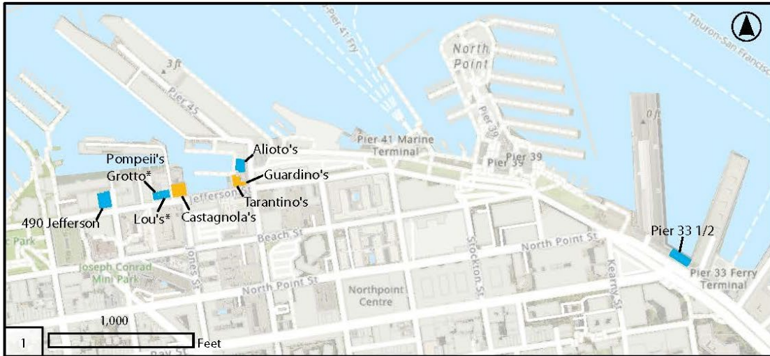
Figure 2. Locations of Vacant, Closed, or Upcoming Sites Requiring New Retail or F&B Tenants (excluding 10 Lombard and 50 Lombard Street)