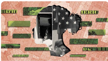
What to know about San Francisco's reparations plan axios.com