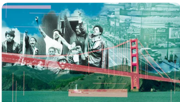
San Francisco supervisors open to reparations proposal for Black people axios.com