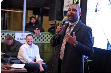
San Francisco considers reparations proposal to give $5 million per Black person foxnews.com