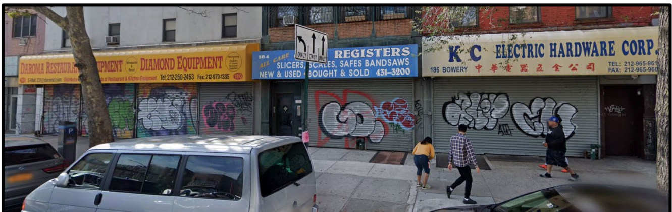
Roll-down Gates in Manhattan

When studying other cities' transparency requirements, staff found that many cities with less stringent transparency requirements struggle with vandalism of security gates. Solid gates provide an easy surface for tagging with graffiti. This problem has become so widespread in New York City that in 2009 the city council passed a law requiring all roll-down gates to be at least 70% transparent. The law requires all roll-down gates in the city to comply with the transparency requirement by 2026.