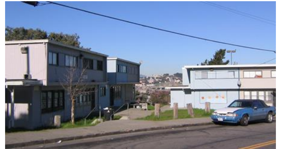
Original Hunters View buildings (2009).