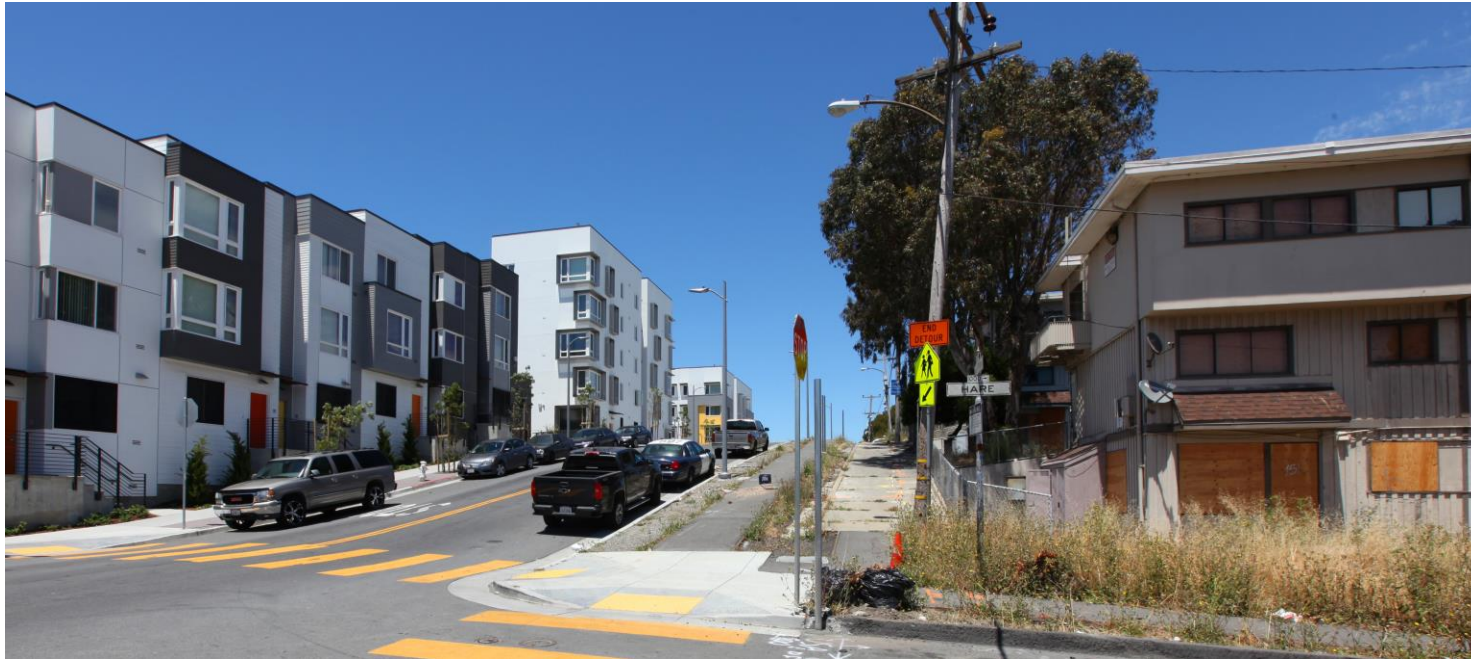
New Phase IIA affordable buildings across Middle Point Road from original buildings in what is now Phase 3 (2017).