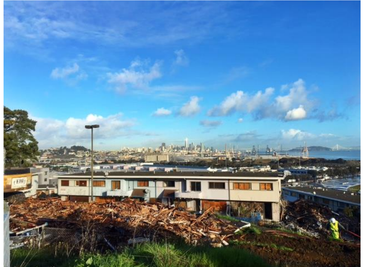
Site preparation activities in Phase 3 (2018).