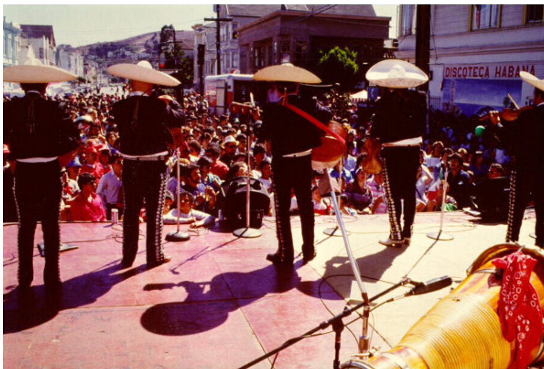
Mariachis at 24 th Street Festival, no date.