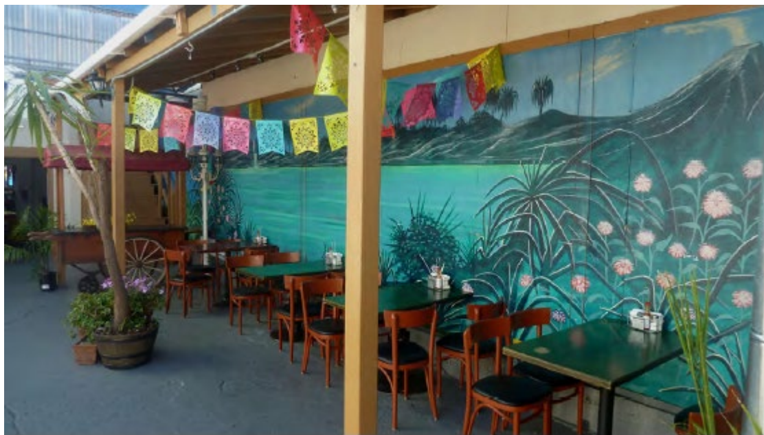
Casa Sanchez (2778 24 th Street), seating area with mural in rear courtyard, view southwest, 2016.