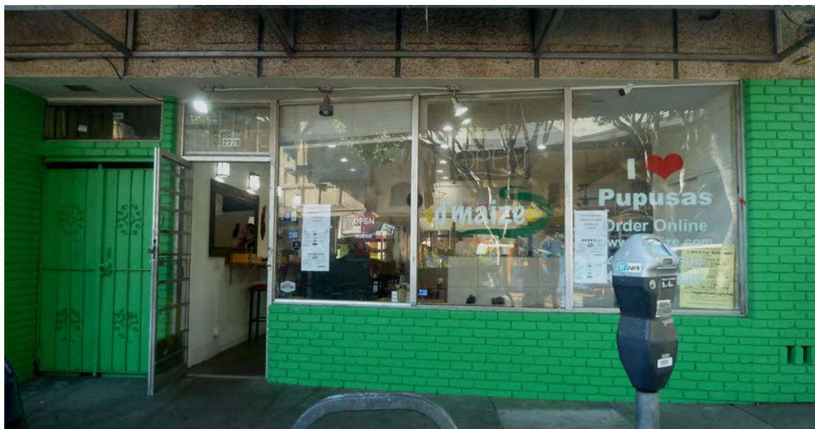
Casa Sanchez (2778 24 th Street), primary façade ground floor, view north, 2016.