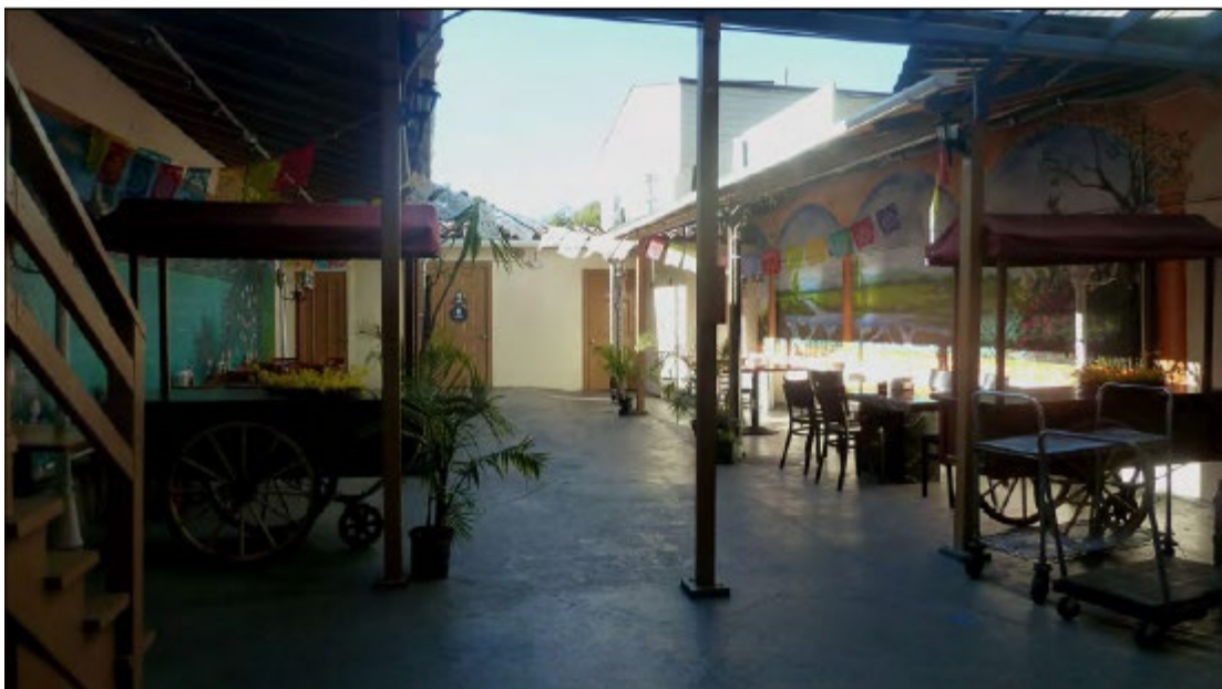
Casa Sanchez (2778 24 th Street), rear courtyard, view north, 2016.