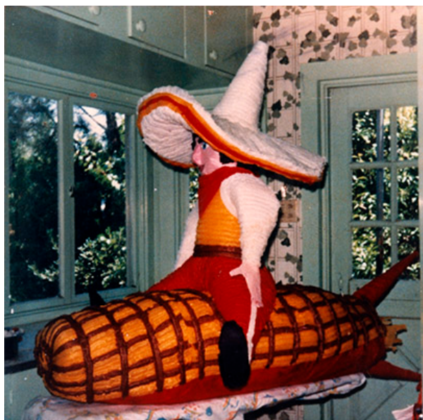
“Jimmy the Cornman” pinata, no date.