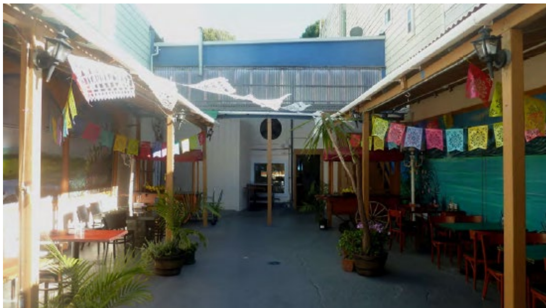
Casa Sanchez (2778 24 th Street), rear courtyard, view south, 2016.