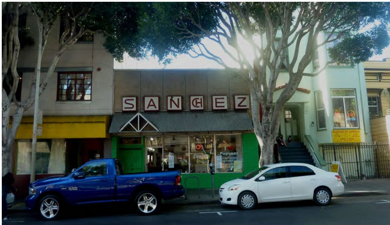
Casa Sanchez (2778 24 th Street) and adjacent buildings, primary (south) façade, view north, 2016.