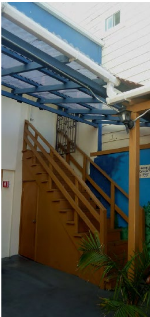
Casa Sanchez (2778 24 th Street Left: Sstairs at rear elevation, view southwest, 2016. Below: Ancillary building at rear of parcel, view north, 2016.