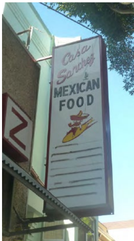
Casa Sanchez (2778 24 th Street), “Jimmy the Cornman” projecting sign at primary façade, view northeast, 2016.