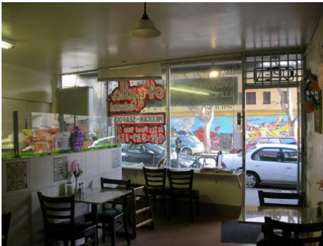
Casa Sanchez (2778 24 th Street), restaurant interior, view south, 2016.