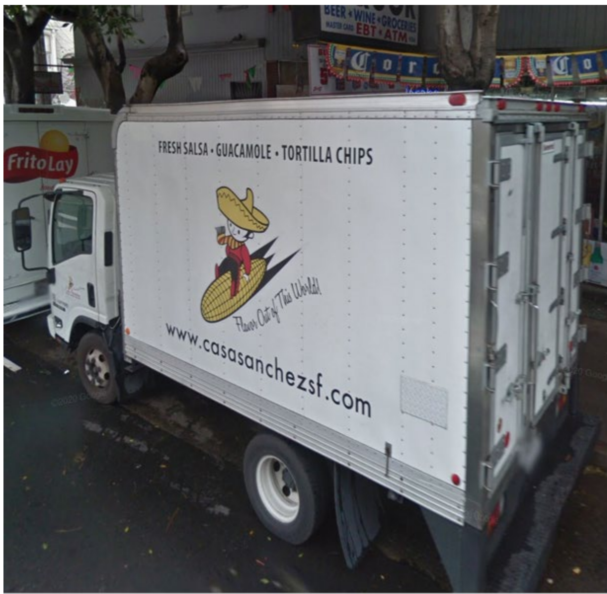
Casa Sanchez distribution truck.