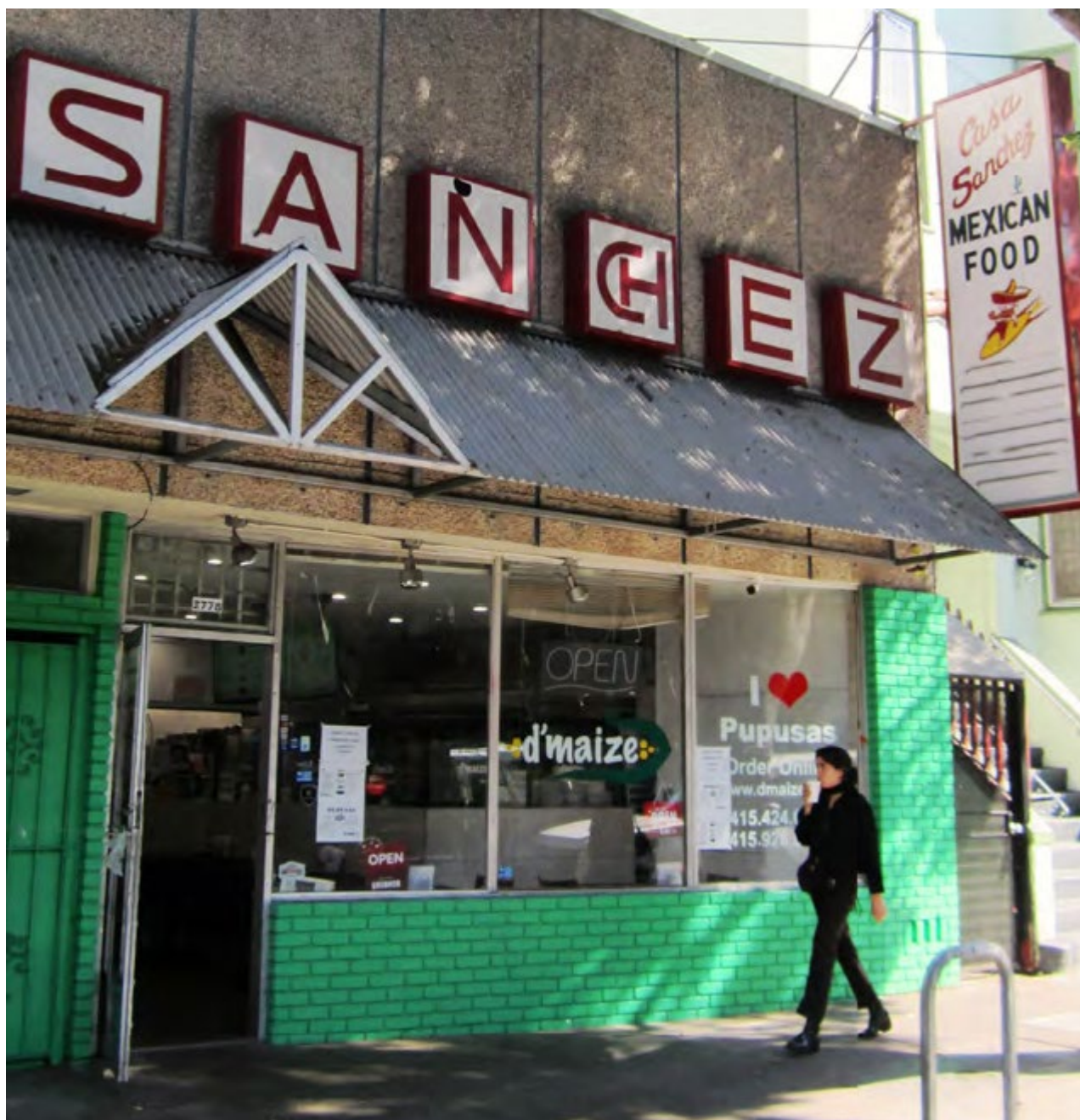
Casa Sanchez, primary façade, view northeast, 2016.