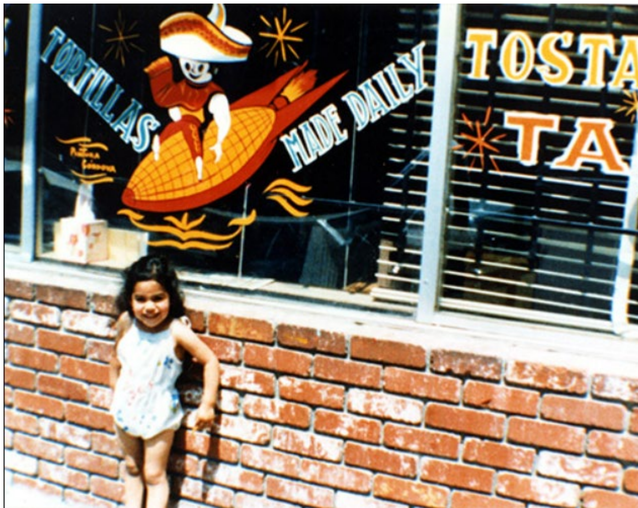
Casa Sanchez (2778 24 th Street), child in front of storefront, c. 1992.