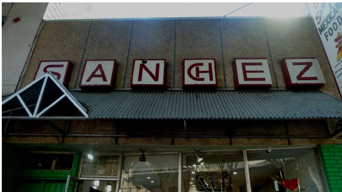
Casa Sanchez (2778 24 th Street), awning and “SANCHEZ” sign at primary façade, view north, 2016.