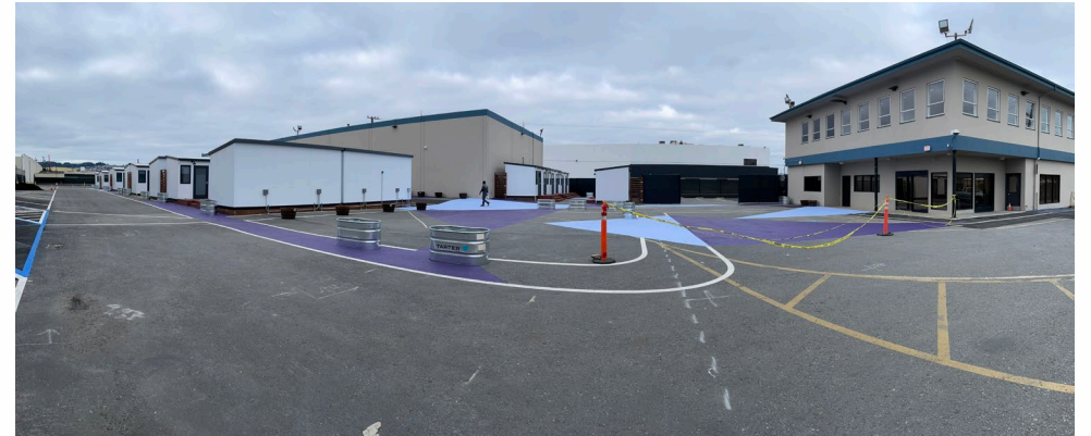
Cabins and Outdoor Space