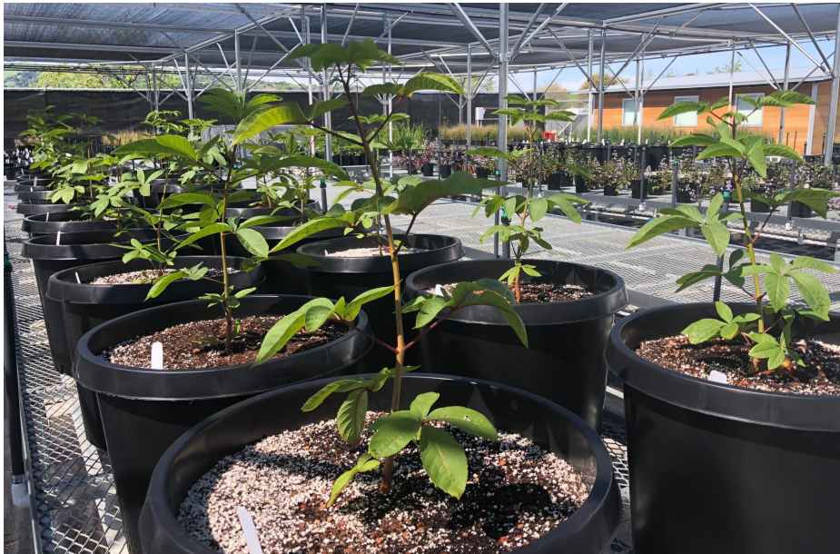
Sunol Native Plant Nursery

Phase 1 – this winter 250 oaks and other native plants grown at Sunol Native Plant Nursery and by SF Rec & Park.