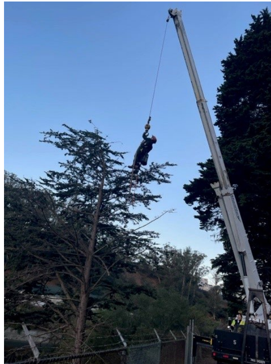
Laguna Honda Res