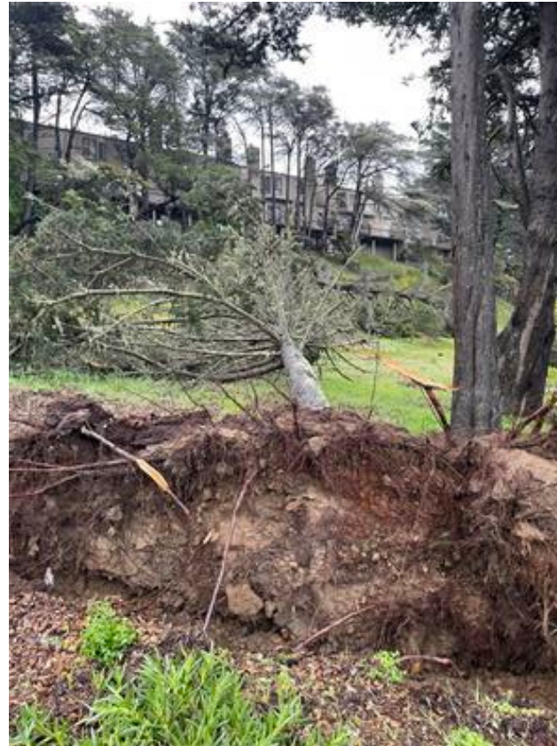
Lake Merced Hills