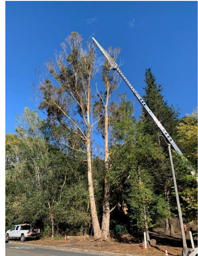
7 th Avenue