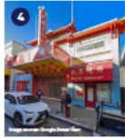
4 Great China Theater 626 Jackson Street Year Built: 1924 Significant for its association with Chinese cultural heritage originally occupied by the Ying Wei Lun Hoop Theatrical Co., a Chinese Opera company, and later as The Great Star Theater showing Chinese-language movies