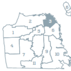
San Francisco Supervisoral Districts