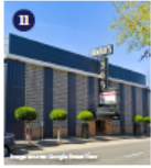
11 Bimbo's 365 Club 1001-1025 Columbus Avenue Year Built: 1981 Significant for its association with Italian American cultural heritage, its Midcentury Modern architecture designed by architect of merit Timothy Pflueger, and as a popular nightclub