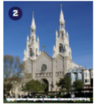
2 Saints Peter & Paul Church 600-660 Filbert Street Year Built: 1922-1924 Significant for its association with Italian American cultural heritage and for its Gothic Romanesque architecture