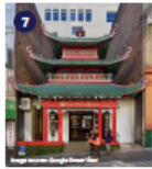
7 Chinese Telephone Exchange 748 Washington Street Year Built: 1909 Significant for its association with Chinese cultural heritage as the only Chinese telephone exchange in the United States