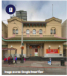
8 Central Chinese High School 827-829 Stockton Street Year Built: 1914 Significant for its association with Chinese cultural heritage as a school that promoted Chinese culture and study