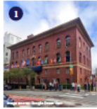
1 University Club 800 Powell Street Year Built: 1908 Significant for its Roman Renaissance Revival architecture designed by San Francisco architects of merit Bliss & Faville originally for Stanford University