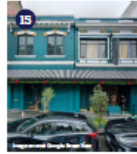
15 Mone's Candlelight Lounge 468-478 Broadway Year Built: 1907 Significant for its association with LGBTQ history in San Francisco as a queer nightclub