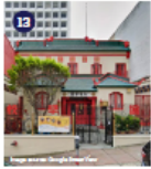
13 Nam Kue School 755 Sacramento Street Year Built: 1925 Significant for its association with Chinese cultural heritage as the original headquarters of the Rock Yam Benevolent Society and later as the earliest and longest surviving school preserving Chinese culture and language in America