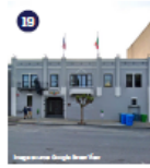
19 Italian Athletic Club 1630 Stockton Street Year Built: 1936 Significant for its association with Italian American cultural heritage and for its Art Deco style architecture