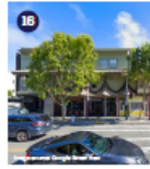
16 Finocchio's 500-508 Broadway Year Built: 1916 Significant for its association with LGBTQ history in San Francisco as a nightclub featuring cross-gender entertainment popular with both the queer community and tourists