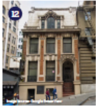
12 George Perine House 535 Powell Street Year Built: 1910 Significant as a rare and very late example of a second empire style house and as the only structure left downtown built as a single-family residence