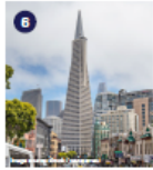
6 Transamerica Pyramid 600 Montgomery Street Year Built: 1976 Significant for its Brutalist architecture designed by architect of merit William Pereira & Associates