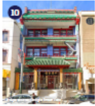
10 Chinese Consolidated Benevolent Association 848 Stockton Street Year Built: 1908 Significant for its association with Chinese cultural heritage as the former HQ of the six hui-kuan, an alliance of rival Chinese factions, which represented the interests of all Chinese in S.F. and the West