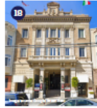
18 Fugazi Building 678 Green Street Year Built: 1912 Significant for its association with the Italian American cultural heritage, LGBTQ history in San Francisco, and architect of merit Italo Zanolini