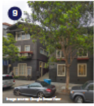
9 Telegraph Hill Neighborhood Association 1788 Stockton Street Year Built: 1907 Significant for its First Bay Tradition architecture designed by architect of merit Bernard Maybeck