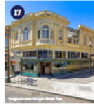
17 A. Cavalli Bookstore / Vesuvio Cafe 203 Columbus Avenue Year Built: 1913 Significant for its association with the Counterculture movement in San Francisco