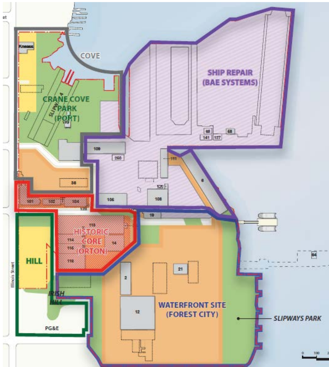
Figure 1: Existing and Proposed Pier 70 Projects