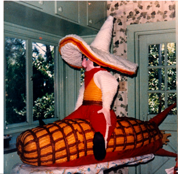
Top right: "Jimmy the Cornman" piñata