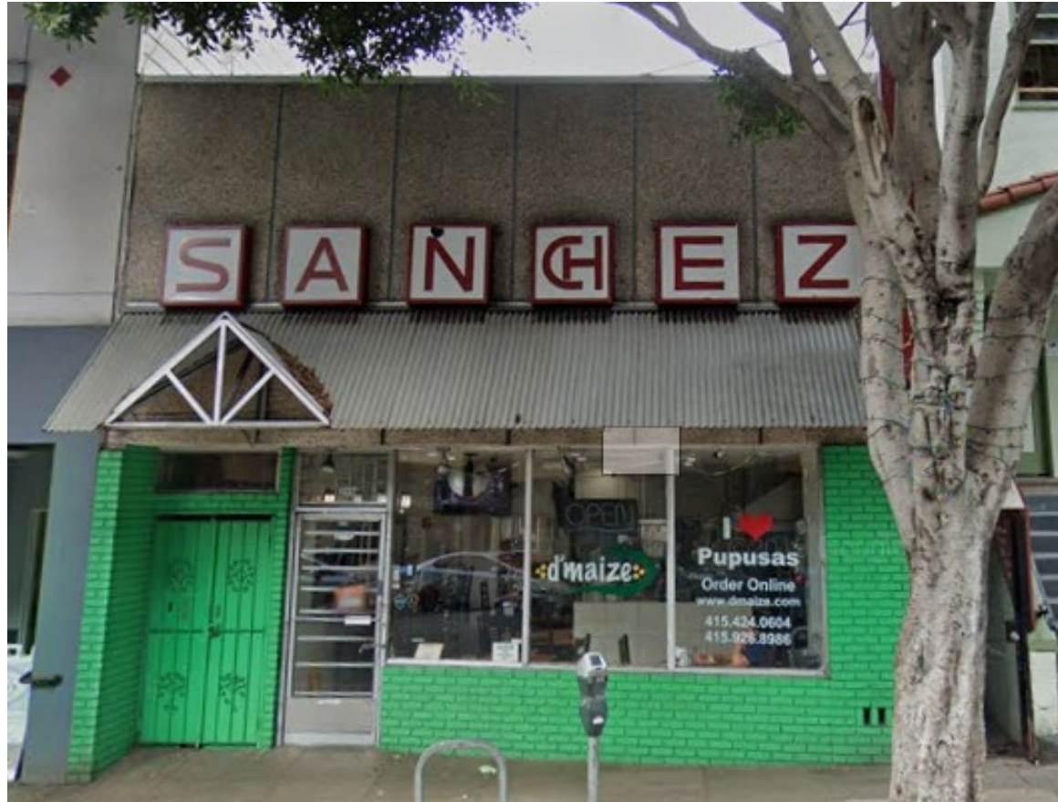
Casa Sanchez Building, 2778 24 th Street